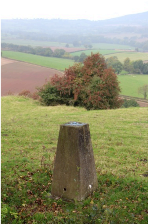
A toposcope in the field by the churchyard, with a view of South Shropshire countryside in the distance.

Alas our first choice proved abortive. The church was locked - although the Guide says that there are 'details of keyholders available' we found none and had to content ourselves with viewing the wonderful countryside from the churchyard.