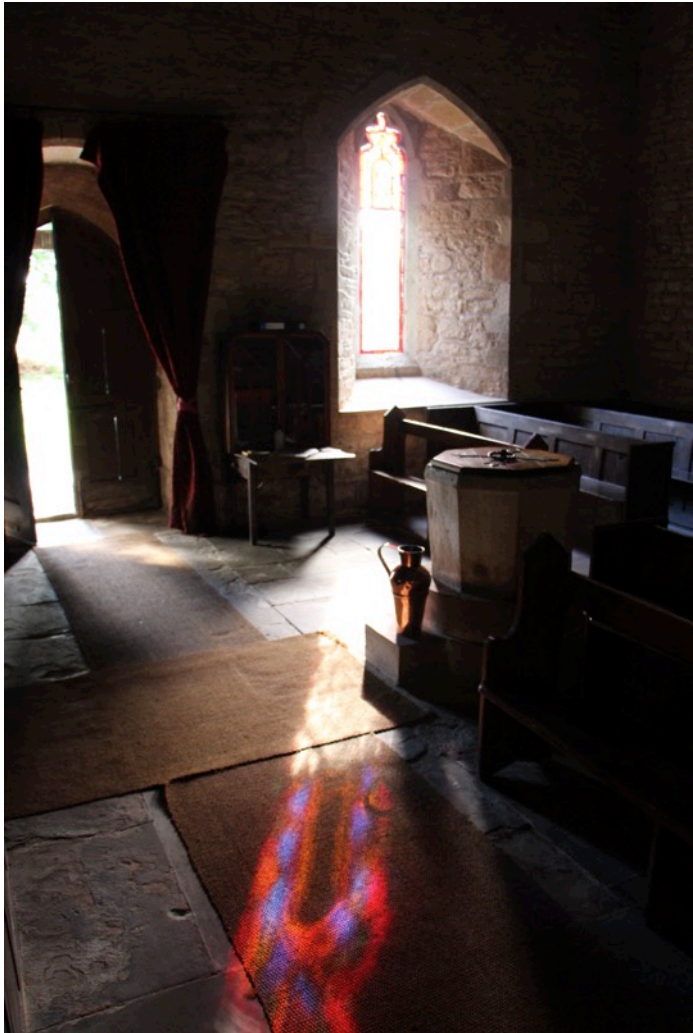
Light from the stained glass window streams across the floor of the nave. A copper jug rests by the font.