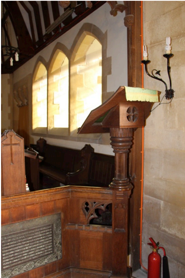
The lectern at St John the Baptist, Boraston.