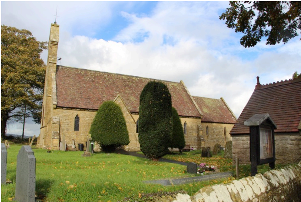
St Giles, Farlow.

Using our copy of ' A Guide to Shropshire's Churches ' by Shropshire Churches Tourism Group, we chose to visit a group of churches in South Shropshire, in the area around Titterstone Clew.