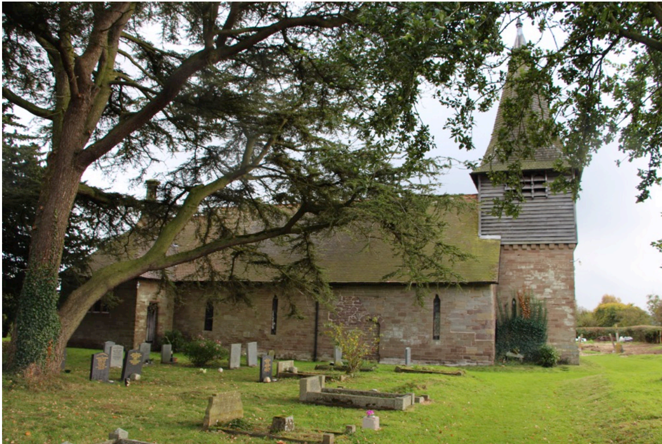
The outstandingly beautiful church and churchyard at St John the Baptist, Boraston.