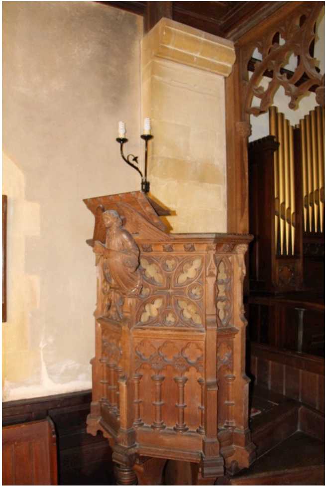
The wooden carved pulpit at St John the Baptist, Boraston.