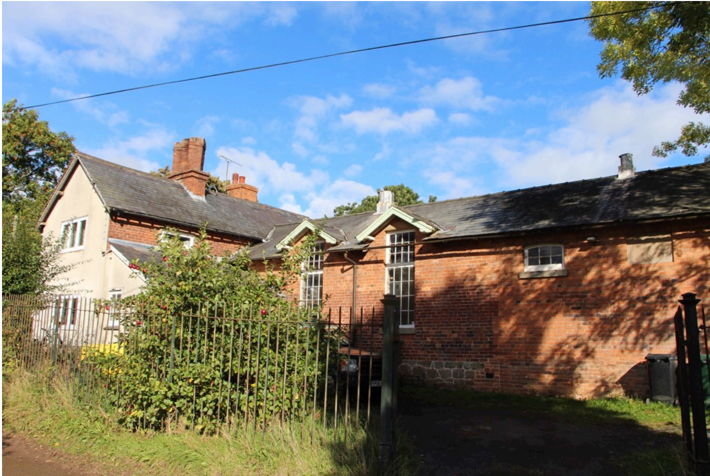
Opposite the church at Nash is a private residence – according to a wall plaque it was formerly a Church of England School, dated 1846.