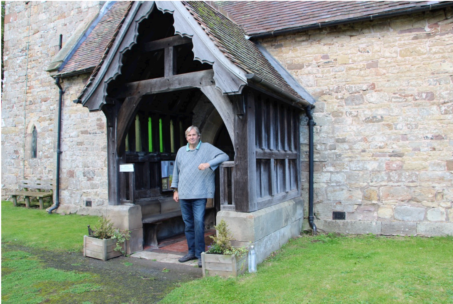
The wooden porch at St John the Baptist, Nash.