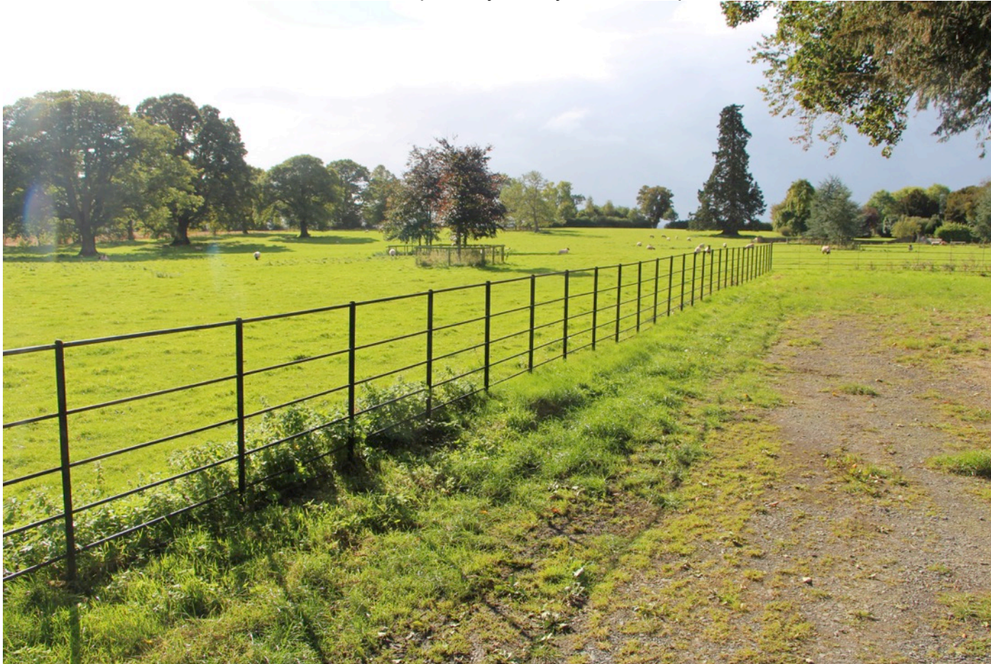
Sheep grazing in pasture by the car park at St John the Baptist, Nash.

Our next destination was Nash. In the Guide, Nash and Boraston are (rather confusingly) grouped together in their listings. Both churches are dedicated to St John the Baptist – yet they are two separate churches, in two discrete locations.