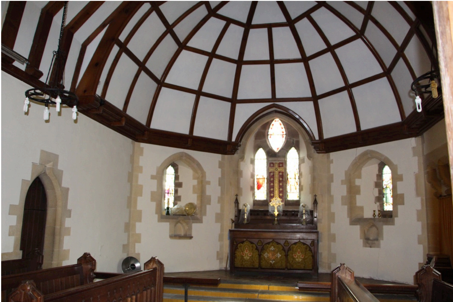
The domed chancel at St John the Baptist, Boraston.