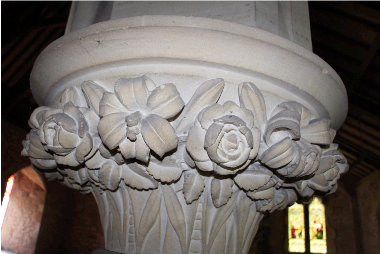
Decorative columns by the north aisle at Nash.