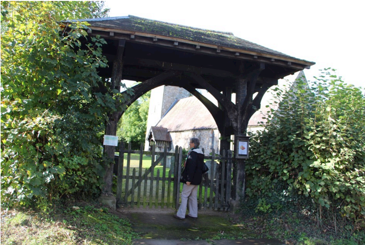
There is a most impressive lych gate leading to the churchyard at St John the Baptist, Nash.

The church of St John the Baptist, Nash , dates back to the early 14 th century with Norman windows in the tower dating back to 1066 – 1154. The church was originally used as a chapel for the ease of Burford (ie built for those who could not easily reach the parish church at Burford), until in 1849 when it became a church in its own right. A north aisle was added to the building in 1865 after it became a church.