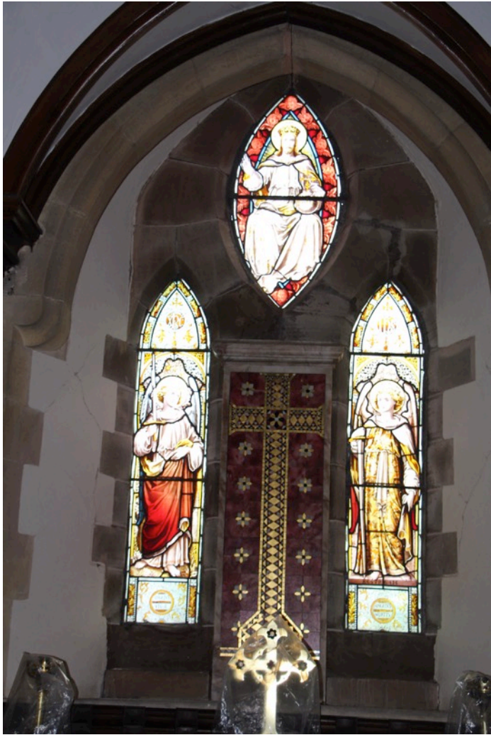
Christ sits in Majesty – with the angels of life and death beneath Him. Between them is a beautiful patterned golden cross.