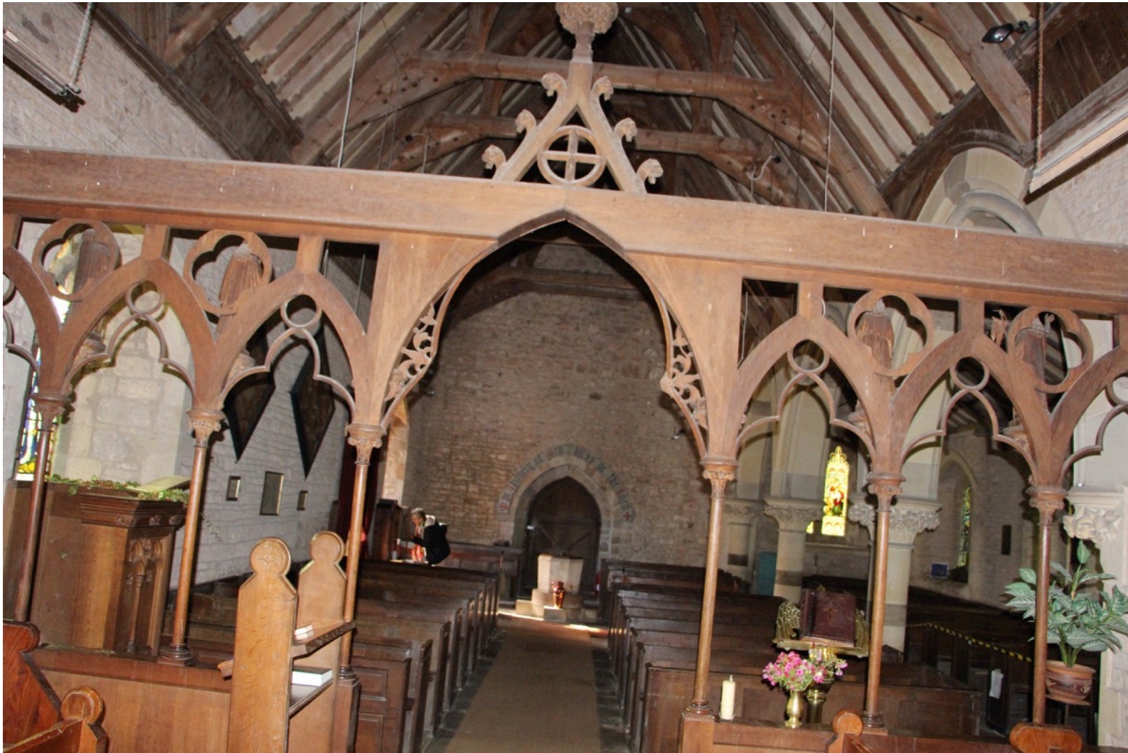
The rood screen and nave at St John the Baptist, Nash.