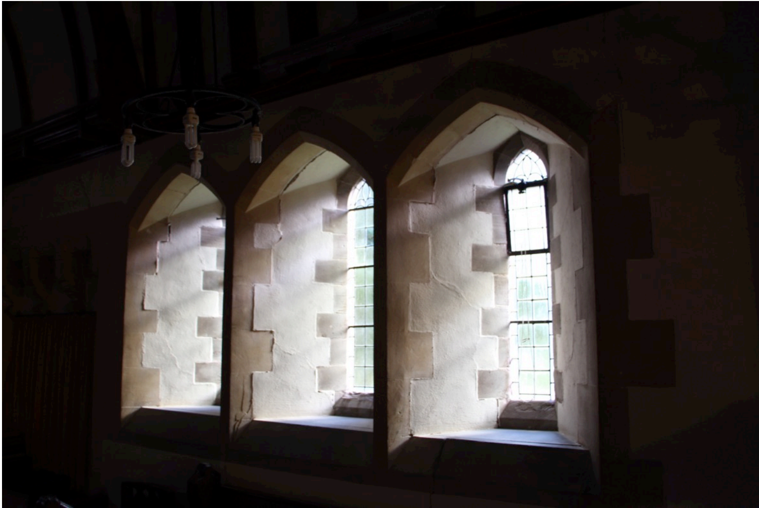
Light streams in through the windows of the south aisle.