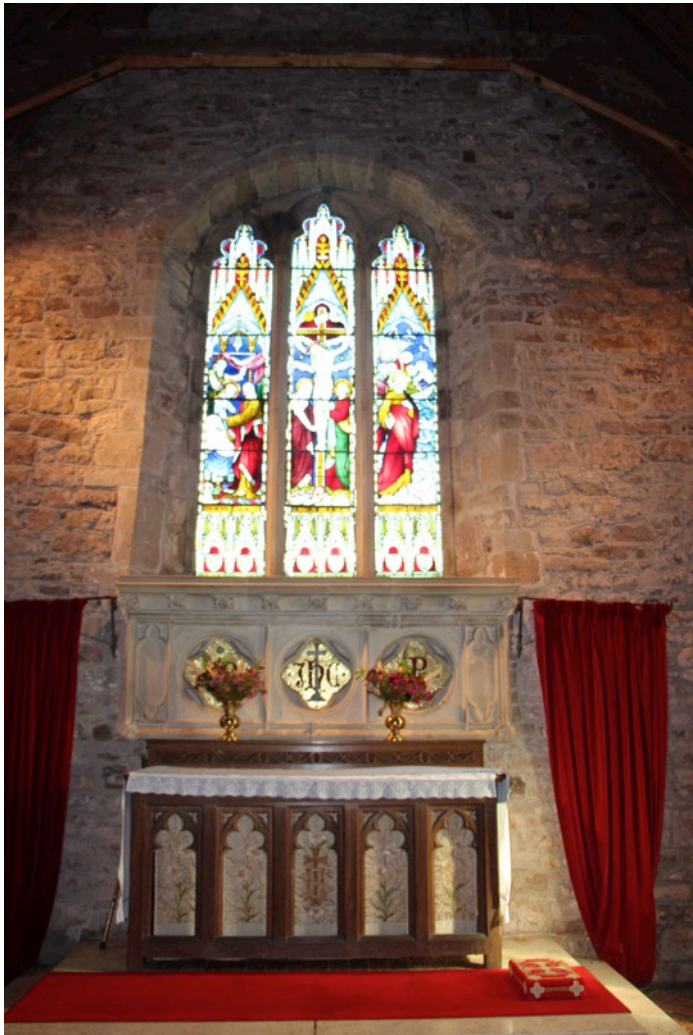
The beautiful altar at St John the Baptist, Nash.