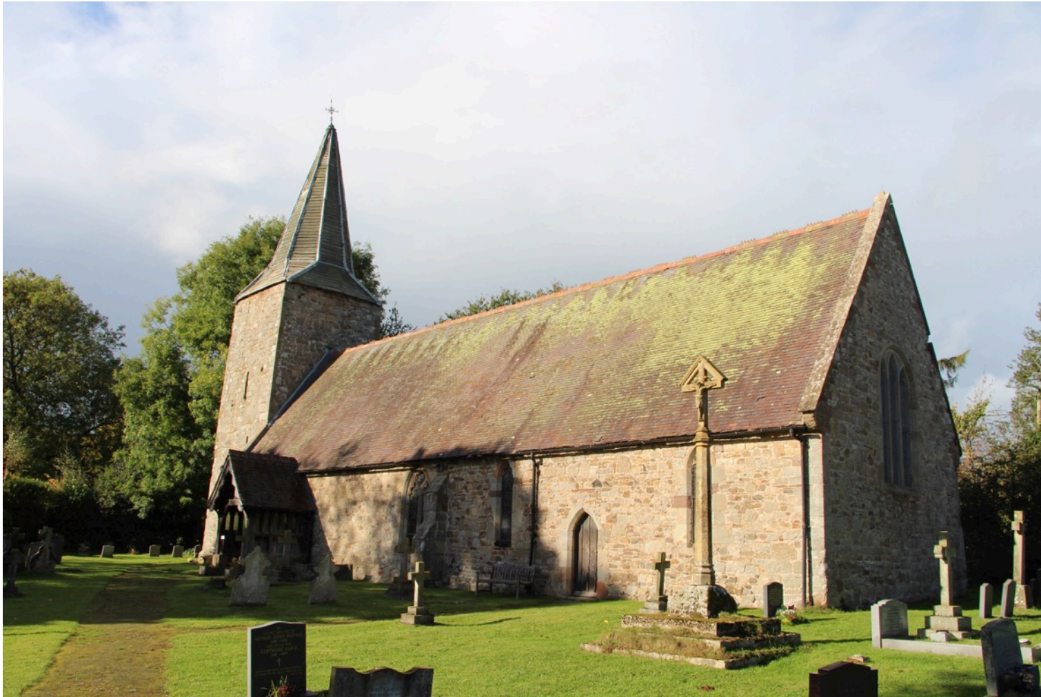
St John the Baptist, Nash.