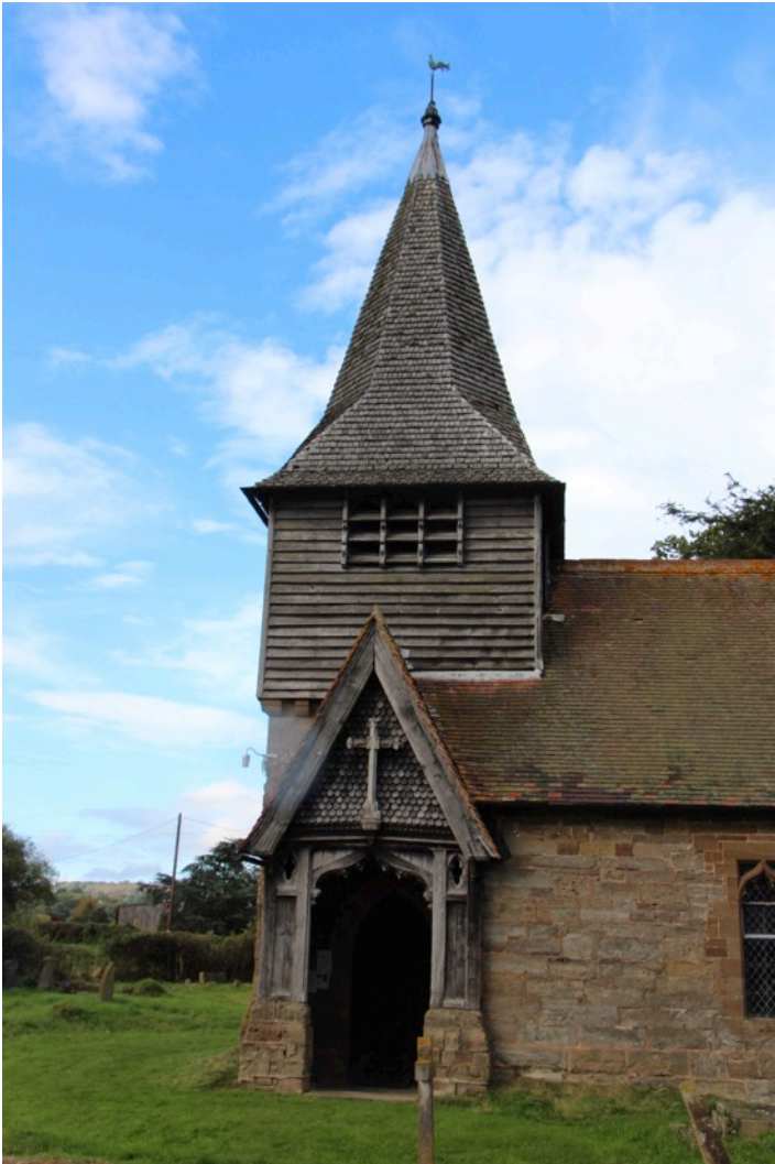
The tower at St John the Baptist, Boraston, clad with wooden slats.