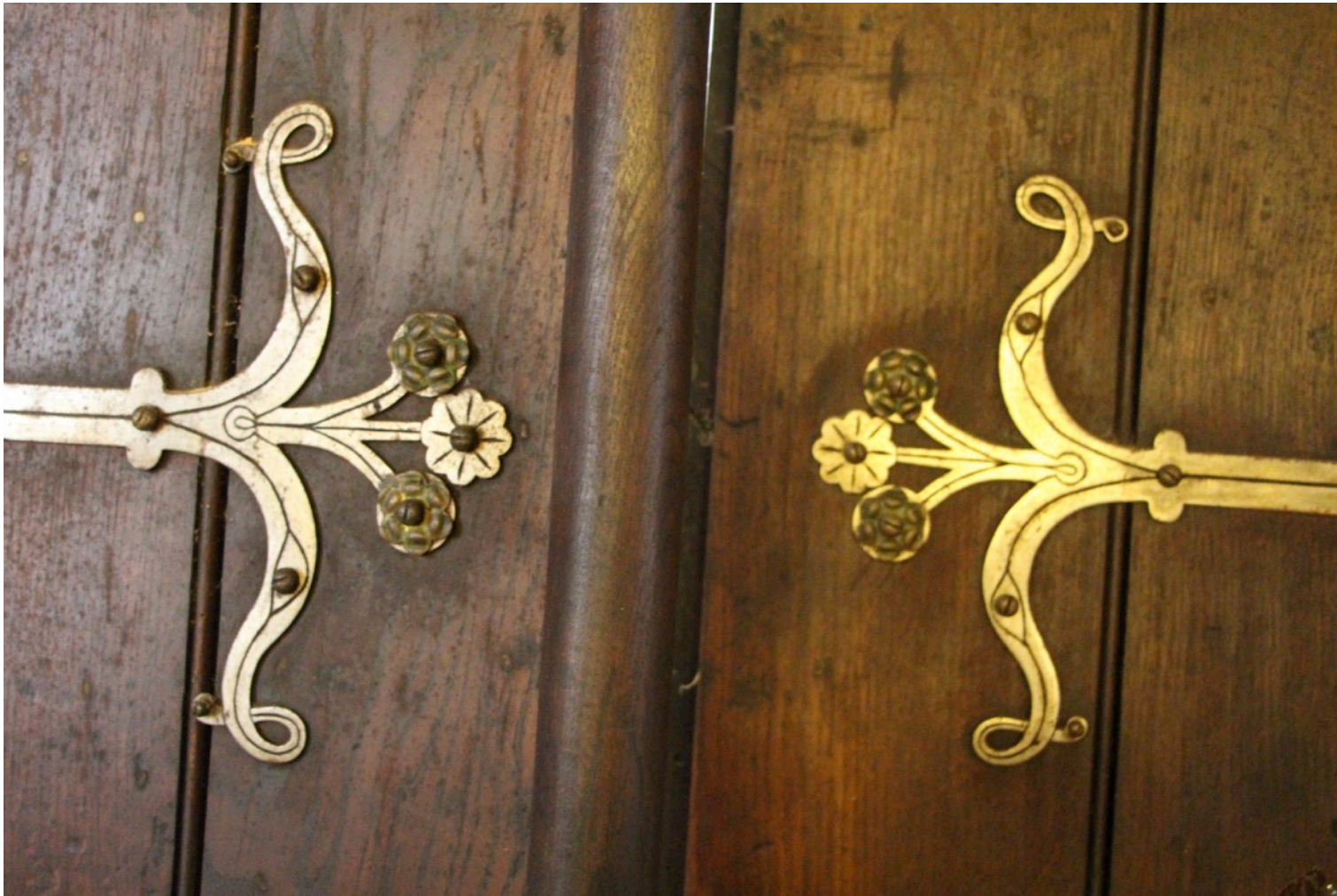
Elegant brass fittings on the rear doors of the nave.