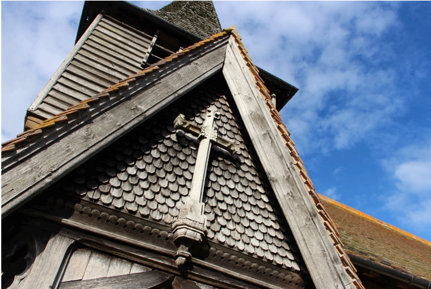
One of the highlights of St John the Baptist, Boraston, is the wooden 'scaling' on the porch.