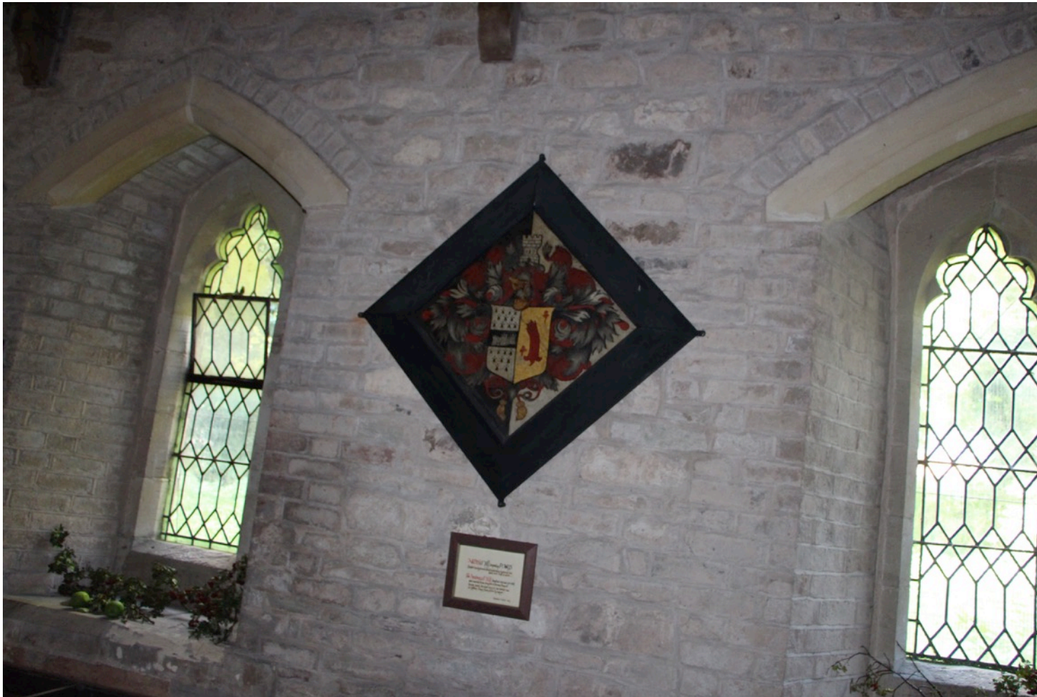
A hatchment, of which there are several at Nash. These bore the coat of arms of the deceased – they were carried in front of the coffin and then erected in the church after the funeral.