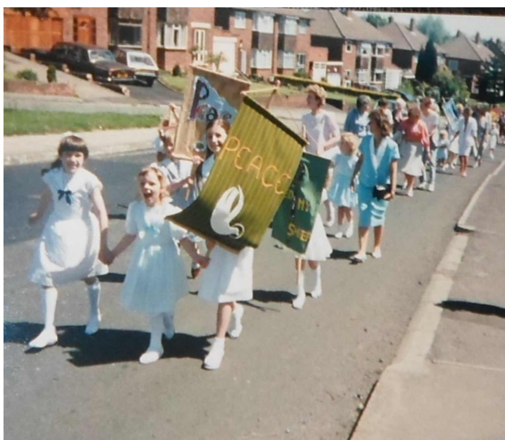
A St Andrew's Church Parade in the 1980s