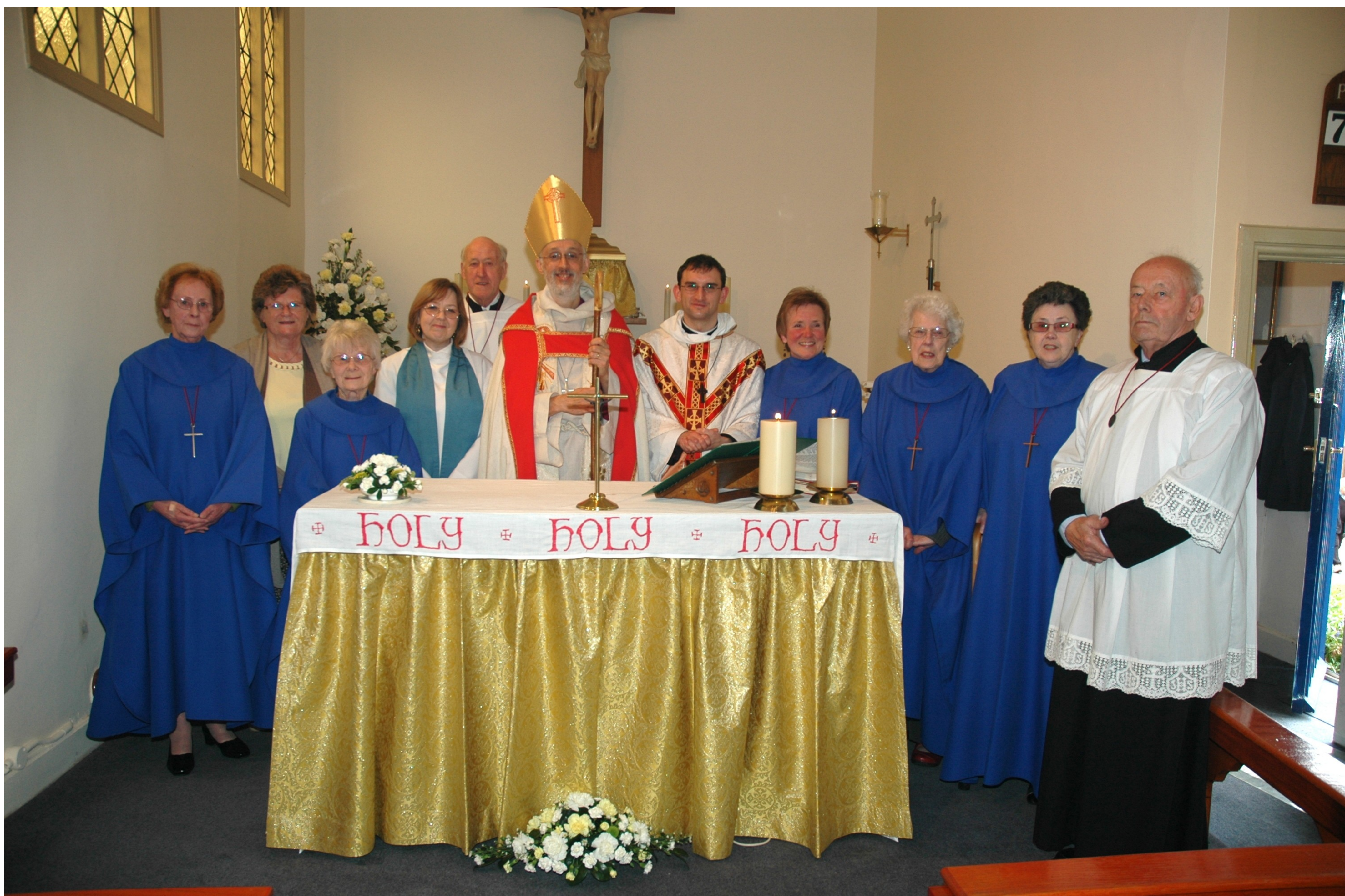
The choir of St Andrew's with the Bishop of Dudley on Easter Day in 2012