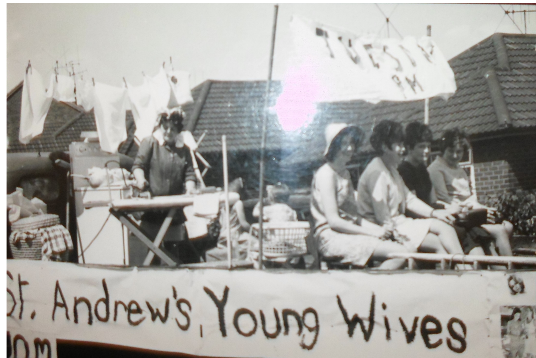
The Young Wives’ carnival float in the 1960s.

Then they built Straits Green School, but by that time the increase in population had begun to level out.”