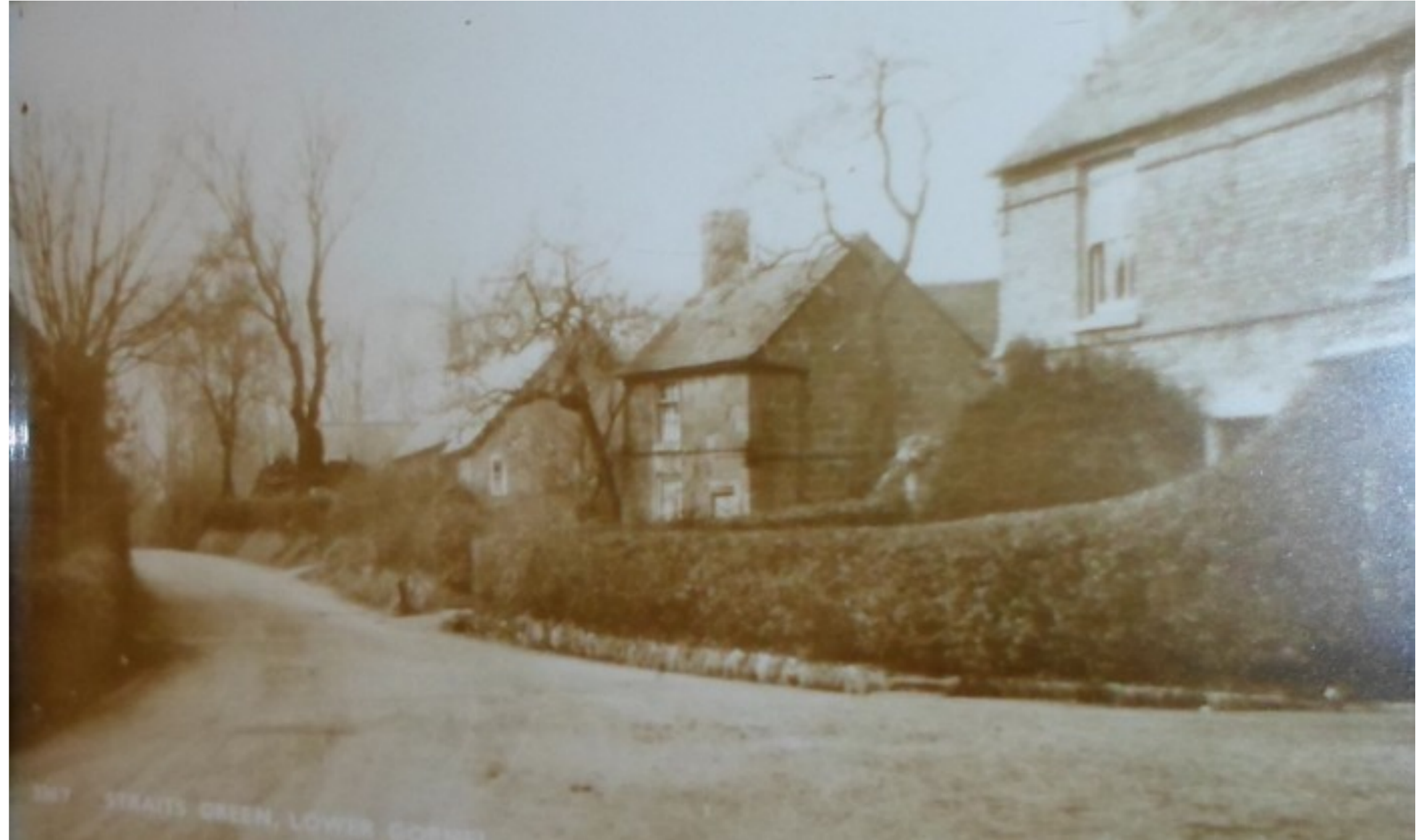
Straits Green in the 1930s

The oldest part of the Straits was the area around Straits Green. The 'hamlet', as it was described in 1914, consisted of a number of miners' cottages opposite a group of larger houses. The miners used to walk up a pathway through the woods around Himley to Baggeridge mine. In the 50s and 60s there were still mines in the Cotwall End area, very near the surface.