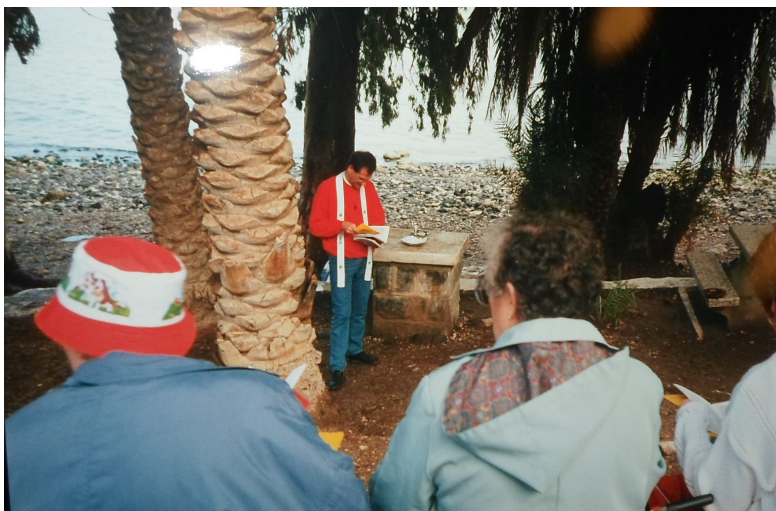
Communion on the shores of Lake Galilee