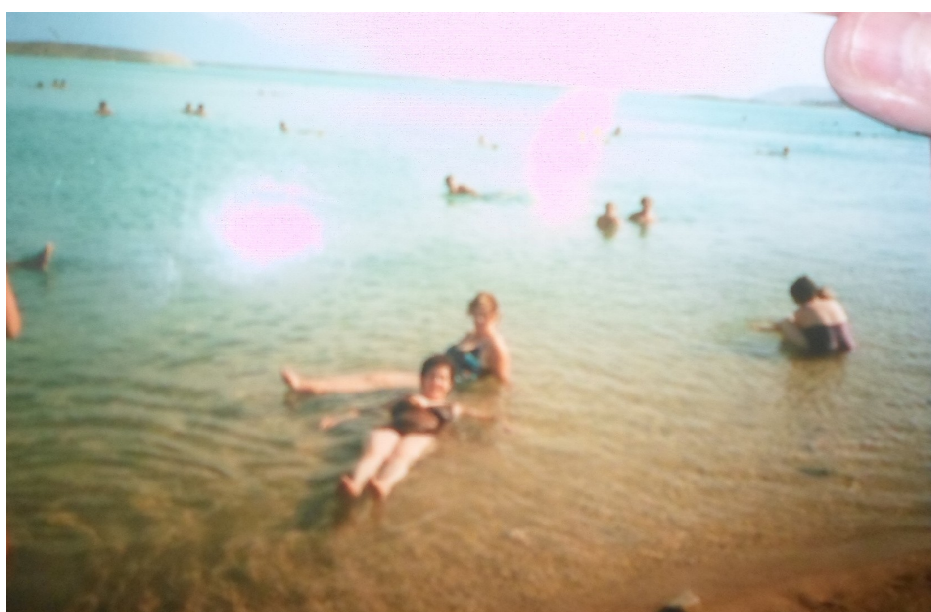
The Dead Sea