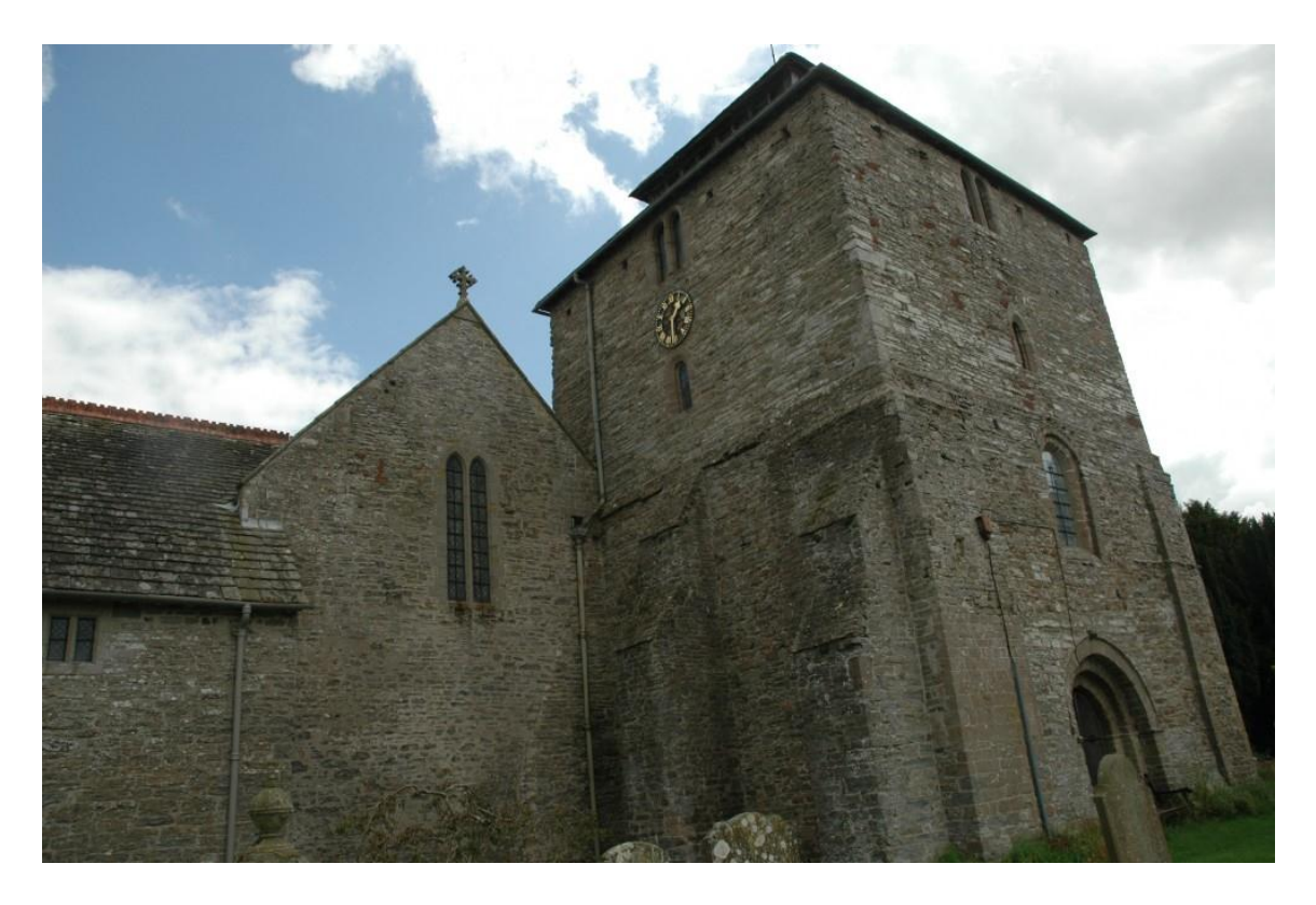
St George's, Clun