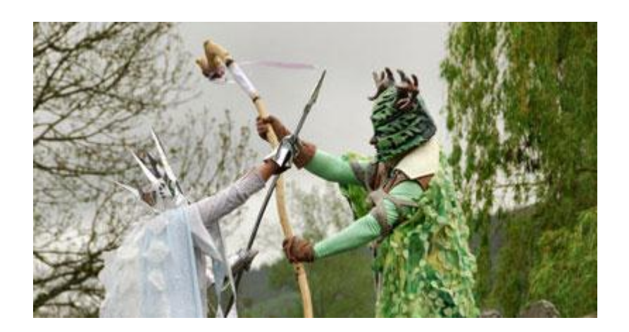
The Green Man battles the Ice Queen on Clun Bridge during Clun's Green Man Festival.