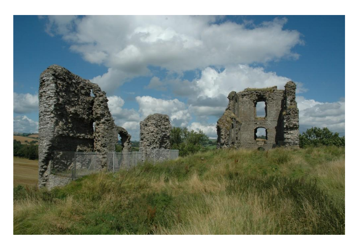
Ruins of the castle on the motte at Clun castle

Despite being called a town, Clun resembles a large rural village and remains very agricultural. We parked in a free car park (complete with 'auto-loos'!) near the bridge over the Clun river. After a picnic lunch we crossed the wooden river bridge and made our way up the steep hill to Clun Castle, a typical motte and bailey affair built by a Marcher Lord to control this part of the border with Wales. It's now in a ruined state but has some excellent interpretive panels that show what it might have looked like in its heyday.