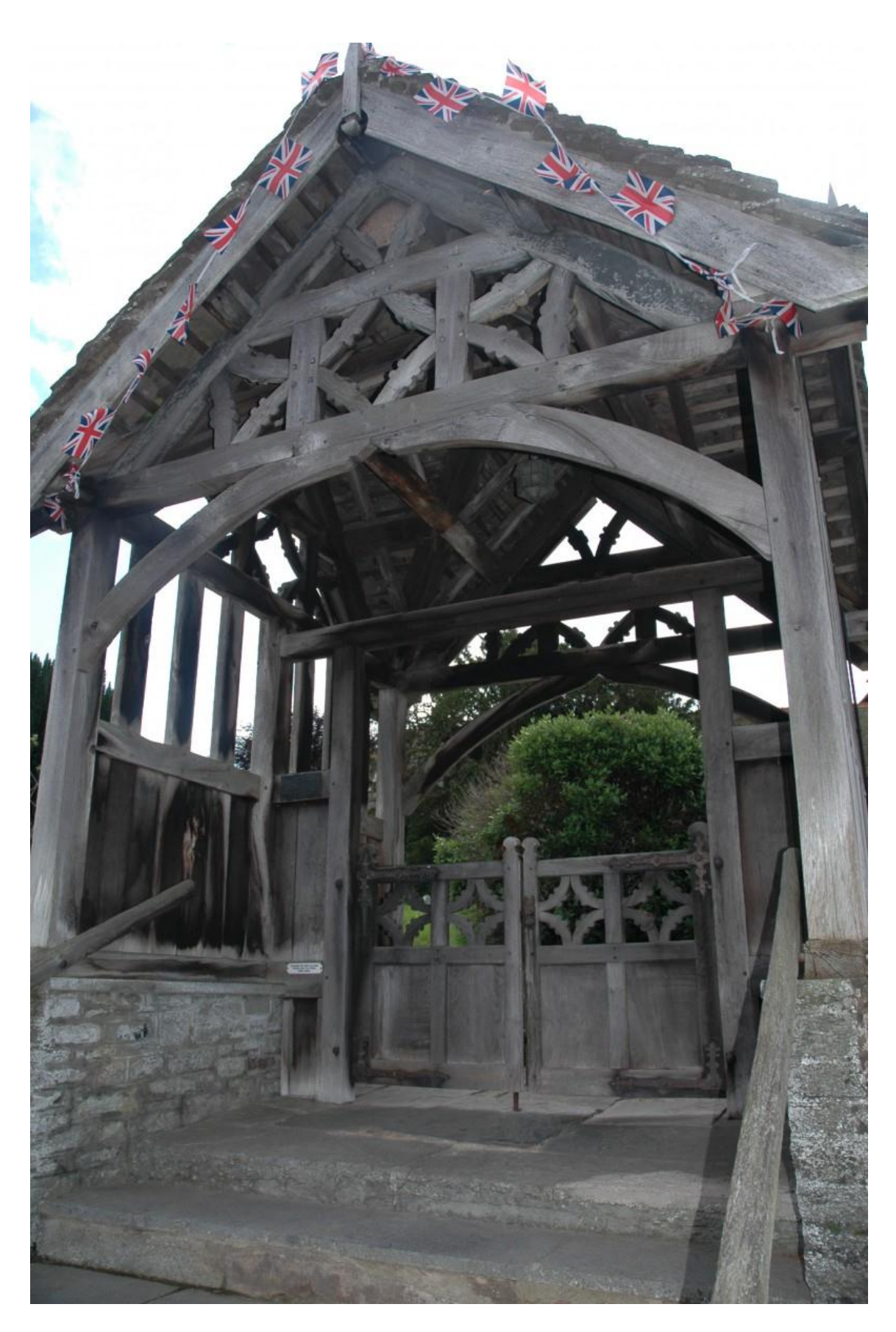
The lych gate at St George's, Clun