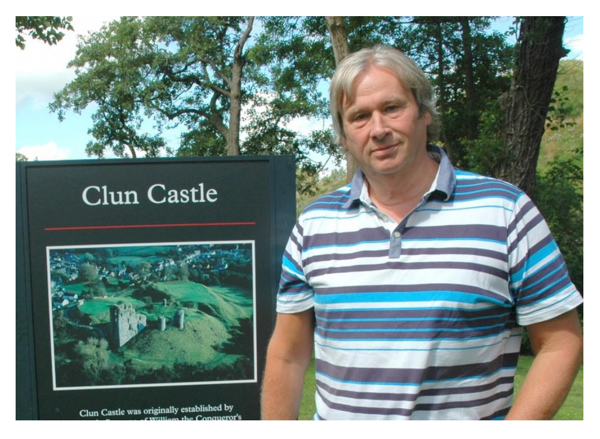
Clun Castle is a typical Norman motte and bailey construction

On a beautiful day in mid-August my wife Magda and I decided to explore two of the churches in the Clun Forest area of Shropshire. We set off from Sedgley around 10.45am, reaching Clun just after noon. The Satnav took us on a route out through Bridgnorth via Craven Arms to Clun.