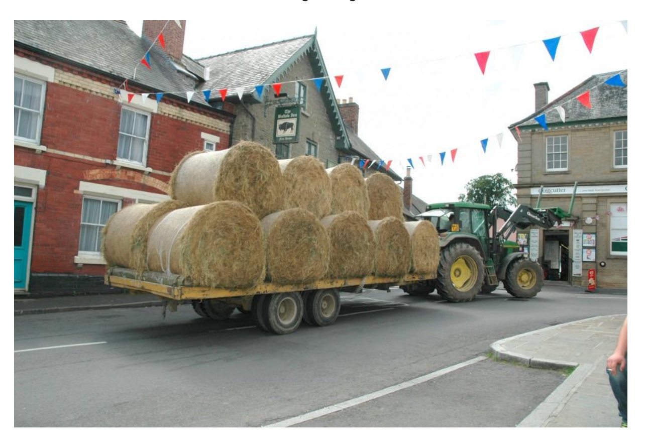
A harvest-time tractor travels through Clun with bales of hay.

We returned down the hill and crossed the famous Clun river bridge that gives access to the main part of Clun. This is the site of the annual battle between the Ice Queen and the Green Man, to allow summer to enter the town. (Alas the festival was cancelled in May 2012 due to heavy rains.) We found a pub in the Square where we sat outside and had a cider and Guinness and watched the people of Clun go by. Along the main street, opposite The Sun pub, there's a newsagent who sells a selection of guide books for walkers and local OS maps. Quaintly, they were closed over the lunch break from 1-2pm.