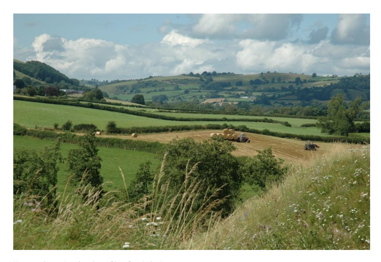
Harvest time - the view from Clun Castle in August.

One of the best aspects of the castle is the glorious views of rural Shropshire - these were spectacular at harvest time. Local farmers were busy harvesting the wheat in the surrounding fields and transporting it away on giant trailers. Another feature was the floodlit bowling green built by local residents on part of the bailey. Other parts of the castle grounds are used every year for the town's Green Man festival, which celebrates the coming of summer to the Clun valley.