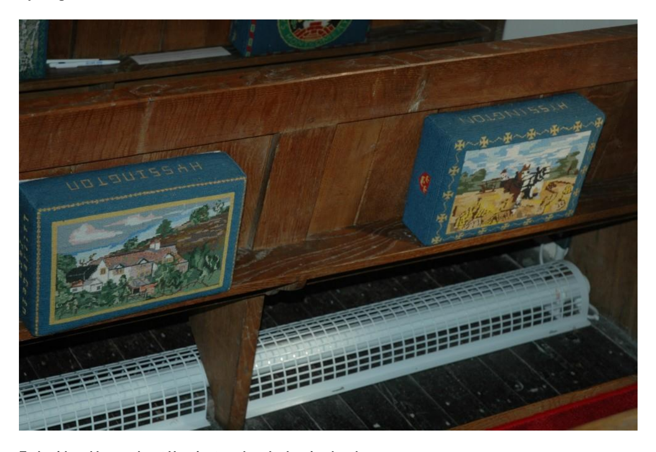
Embroidered hassocks at Hyssington church showing local scenes