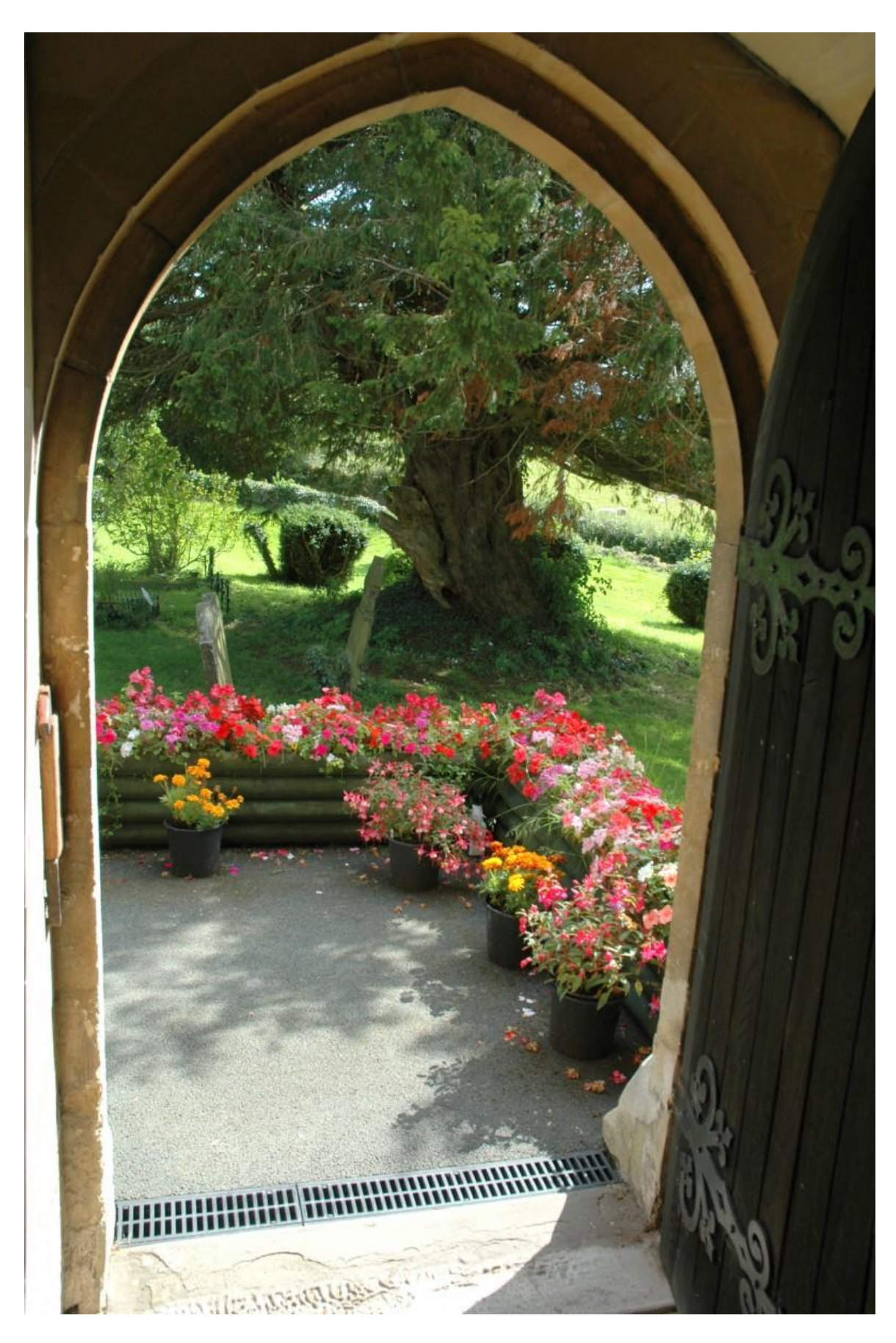
Entrance door and ancient yew at Hyssington church. The step bears the marks of the 'demon bull of Bagbury' who is rumoured to be buried beneath.