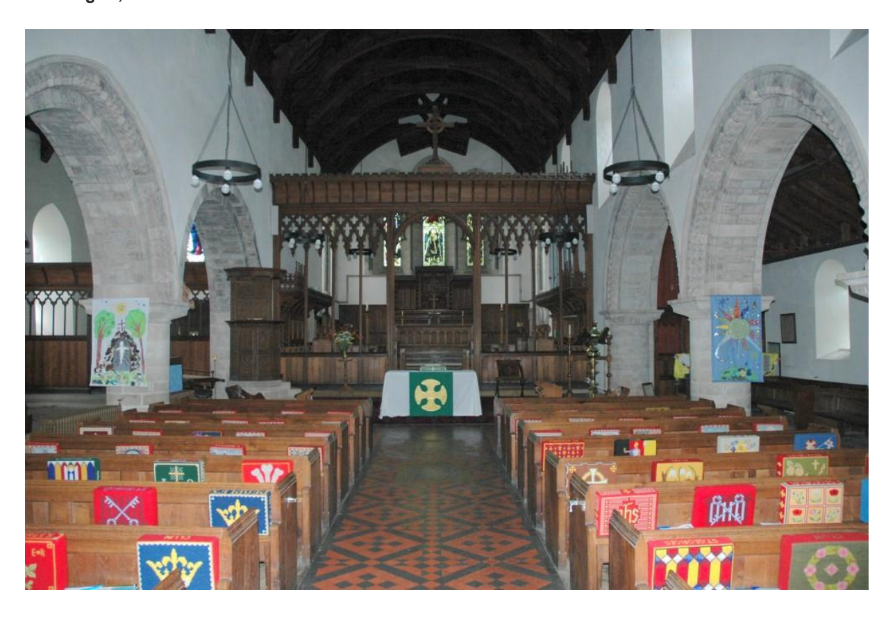
Inside St George's Clun - note the brightly coloured hassocks (kneelers) in the pews.