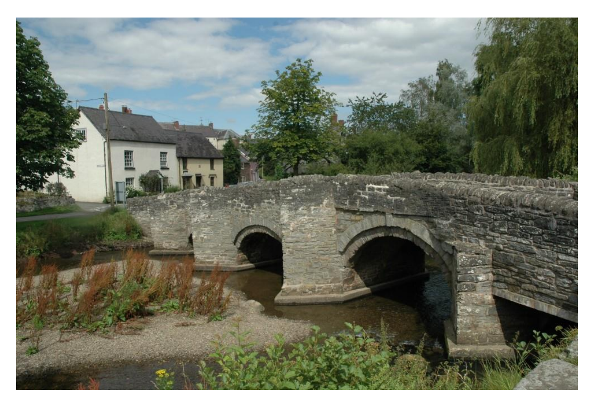
Bridge over the RIver Clun, site of the battle between the Ice Queen and the Green Man in May each year.

The original 'angry young man' who shot to fame as the author of the play 'Look Back in Anger' in 1956, is buried there, alongside his fifth wife. For the last 10 years of his life he lived in a magnificent house called The Hurst in Clunton near Clun, which is now owned by the Arvon Trust and has been turned into a centre for writers. He called the view from the Hurst 'the best view in England'.