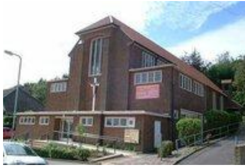
St. Peter's, Upper Gornal (1841);