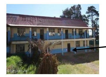
The door to the classroom / makeshift laboratory. My home for 12 Of the 13 years I spent at PI. On the LH of the picture are tree ferns in a damp garden, which I planted to show and teach plant succession.