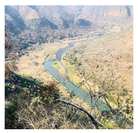
Umkomaas River from the top of Lundy's Hill

On Wednesday, 13th April 1977, I set off from Pietermaritzburg, in my first car, a turquoise blue VW Beetle, down the R617, to Bulwer. I passed a few other vehicles on the 80-minute journey. It was an adventure as the road goes along a fairly flat plateau, before dipping down Lundy's Hill to the Umkomaas River. The climb out of the valley is steep and has many tight corners on its way up the side of a mountain. A Zulu village, Hlanganani, is towards the top of the mountain on that side of the valley. The river demarcates the start of tribal land, and the settlement of Hlanganani, and the surrounding area was, and is still, controlled by a local Zulu chief.