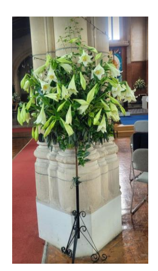
Previous Easter lilies