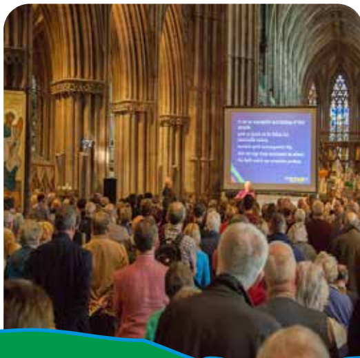
'First Steps' - Lichfield Cathedral 2017