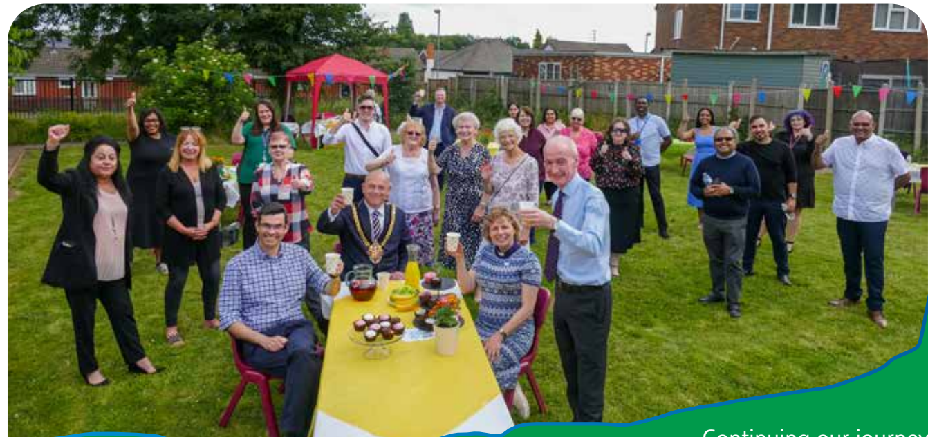
The Big Lunch - Bradley