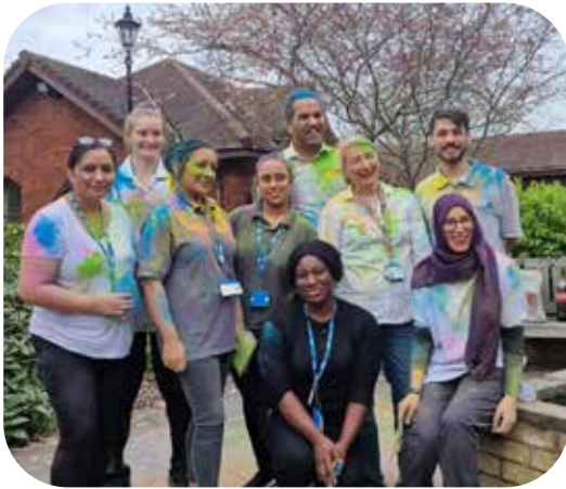
Anglican and other chaplains at Black Country Healthcare NHS Foundation Trust