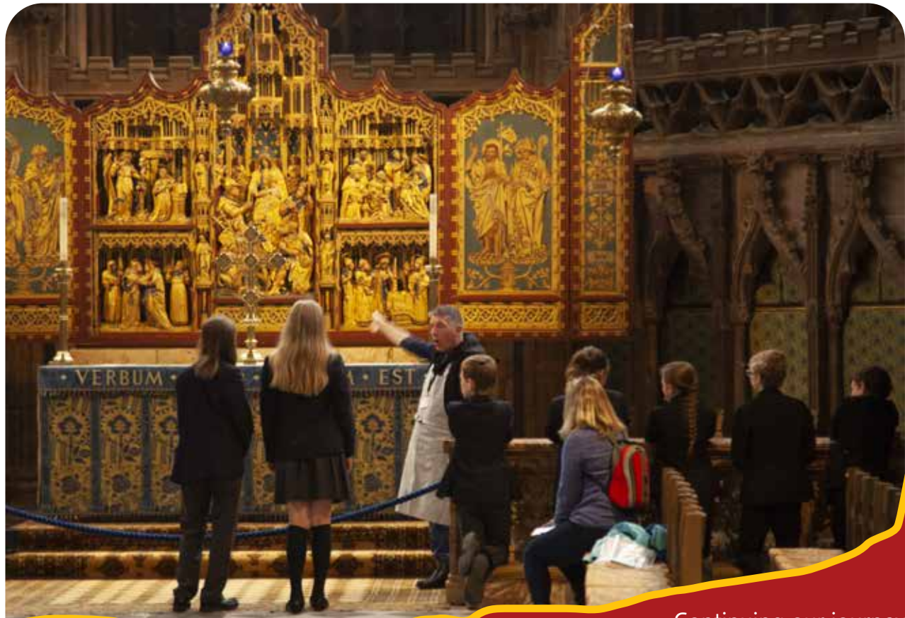
Pupils discovering the riches of Lichfield Cathedral as part of the Inspire programme