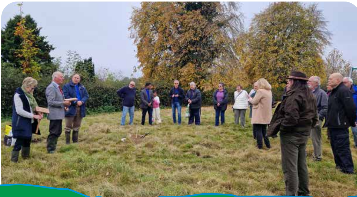
Tree planting - Ellastone