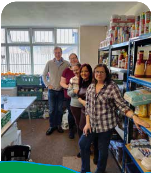
The Food Bank - Chell Parish Church

Our communities need us: we have some of the most deprived parishes in the country meaning that our diocese receives more than two million pounds from the national church each year to support lowest income communities – we are the fourth largest recipient of this funding in the country.