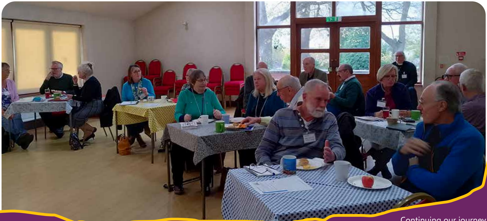
Churchwardens from around the diocese meeting for mutual support