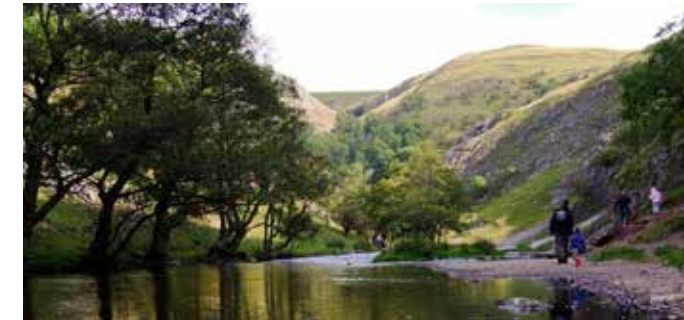
Dovedale (location of one of the Diocese’s two residential retreat centres)

Rail links are also good with all major towns having direct services to London and Birmingham and four major airports surround our borders – Birmingham, East Midlands, Manchester and Liverpool.