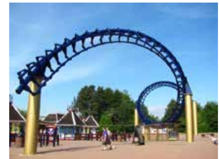
Alton Towers near Uttoxeter