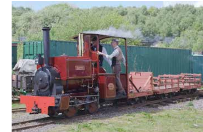
Apedale Valley Light Railway near Stoke with the adjacent country park and Heritage Centre is one of many transport and leisure museums in the Diocese / Simon Jones