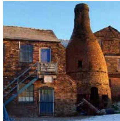
Stoke-on-Trent Bottle Kiln

Staffordshire prides itself on being ‘the Creative County’: Shropshire is the birthplace of the Industrial Revolution and the Black Country is renowned for its industry and all have significant opportunities for spouses who wish to develop careers in any sphere.