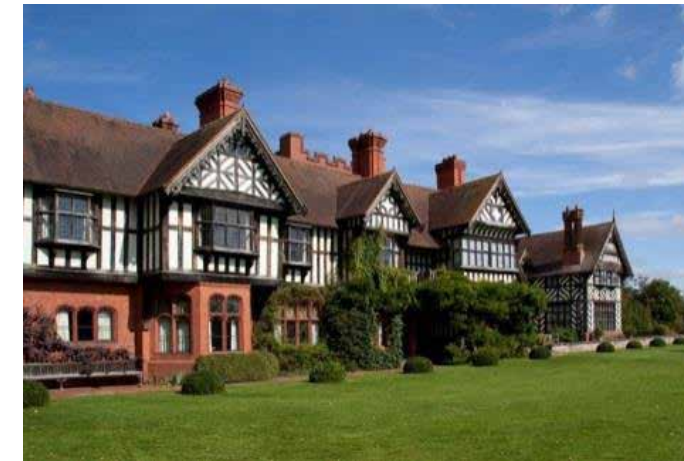
Wightwick Manor nr Wolverhampton