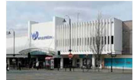
Wulfrun Centre in Wolverhampton is one of many shopping destinations in the region

If shopping is your thing, there is a range of options, from the chic boutiques at Barton Marina, and Shrewsbury to large malls in or near the urban centres. We’re fortunate in being the home of many fine ales and beers brewed in Burton on Trent (the museum is well worth a visit), and Staffordshire oatcakes are a unique local delicacy to be discovered.