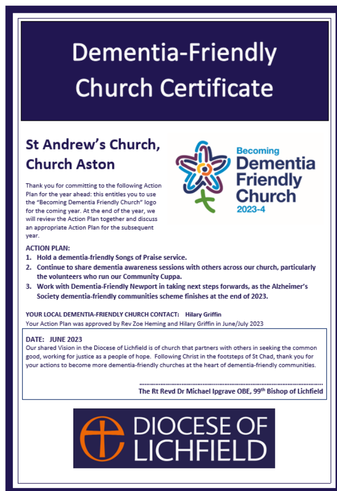
Dementia-Friendly Church Certificate

It’s not an end. There’s a life to live.