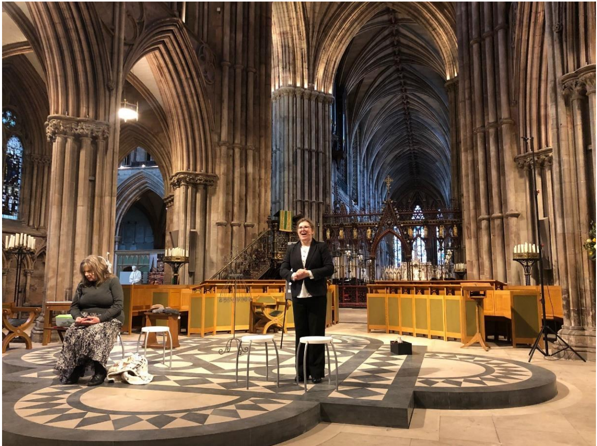
Performance in Lichfield Cathedral of “The Disappearance of Eliza Grey”, a dementia-focused play