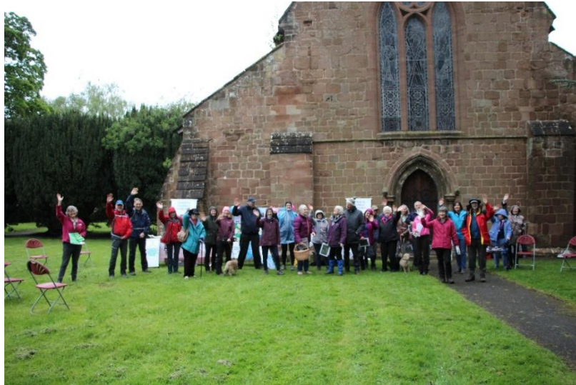
Sponsored Memory Walk organised by one of our churches