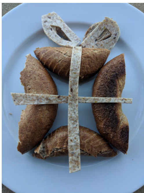
Celebrating the generosity of a really thoughtful gift