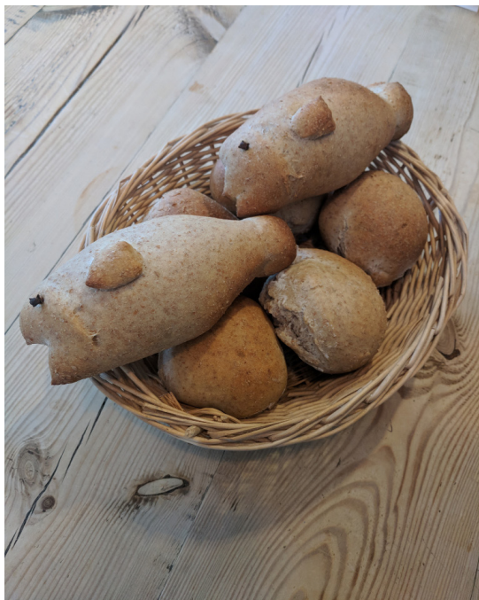
Celebrating the generosity of the feeding of the five thousand

Some examples of what the bread creations may look like: