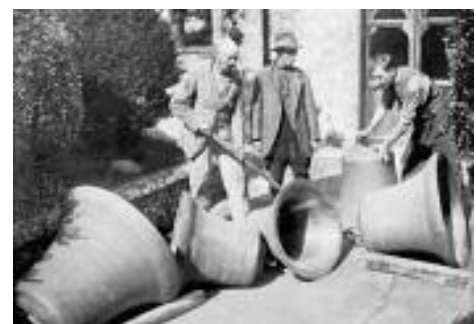
Re-cast bells 1933

When work commenced it was also found that the Tenor bell number 5 was also cracked. It was decided that all five bells be re-cast in order that the whole peal would blend together harmoniously. The estimate was £207 but the cost escalated to £277. An appeal was launched to pay for the work and a special Gift Day was held.