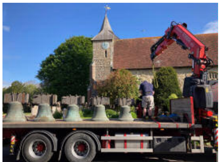
The six Willingdon bells removed from the tower, for the first time in 90 years.