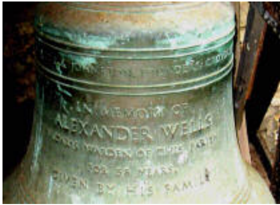
Treble bell 'Wells' inscription