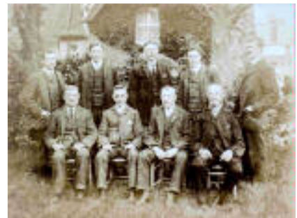
Willingdon ringers 1908

1933 Extensive repairs were needed to the bells. Two bells were badly cracked, number 1 and 4 and the 200-year-old English oak bell frame was loose at the joints. Whilst ringing for the Morning Service on Easter Day the clapper of the tenor bell fell off with a loud crash, due to the bell wobbling on loose bearings.