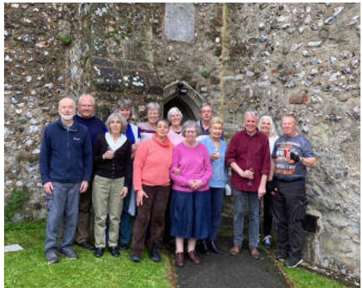
Coronation Day 6 th May 2023

Tuesday 9 th May – Thursday 11 th May 2023, the Bells of St Mary's Willingdon were removed by the firm of Nicholsons, bellhangers of Bridport and taken To Dorset for restoration work. They were last removed from the tower in 1933.