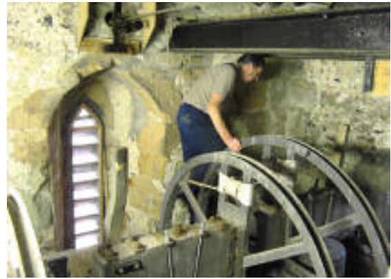
Inspecting the bells

The bells are rung regularly for Sunday services, for weddings and on Royal, National and other special occasions. They were rung in 2000 to mark the Millennium and in 2012 to mark both the Diamond Jubilee of Queen Elizabeth II and also for the opening day of the London Olympic Games.