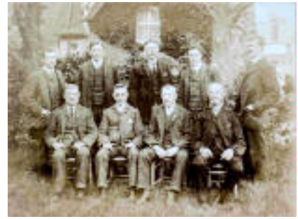
Willingdon ringers 1908

1933 Extensive repairs were needed to the bells. Two bells were badly cracked, number 1 and 4 and the 200-year-old English oak bell frame was loose at the joints. Whilst ringing for the Morning Service on Easter Day the clapper of the tenor bell fell off with a loud crash, due to the bell wobbling on loose bearings.