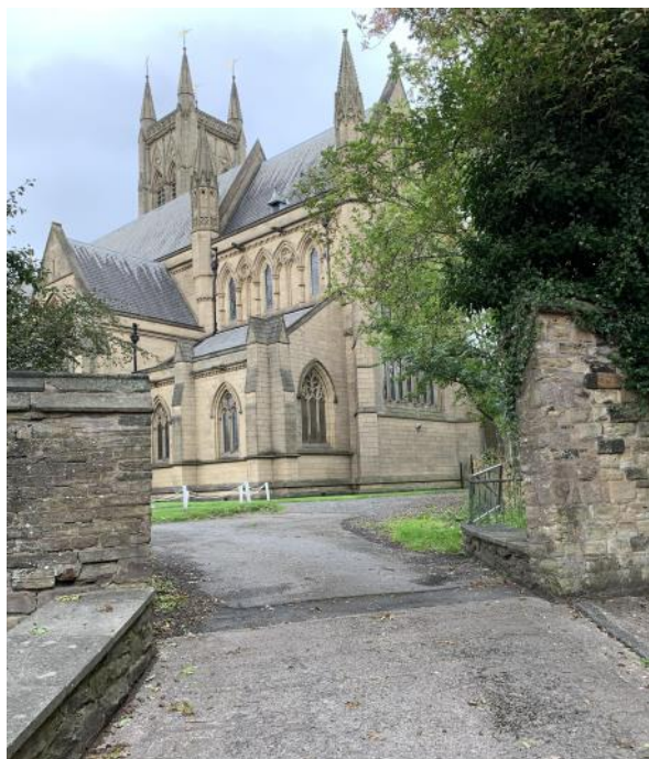
Above: View of Bolton Parish Church