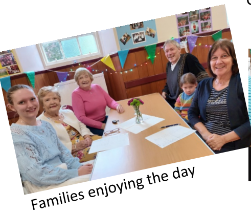
Families enjoying the day