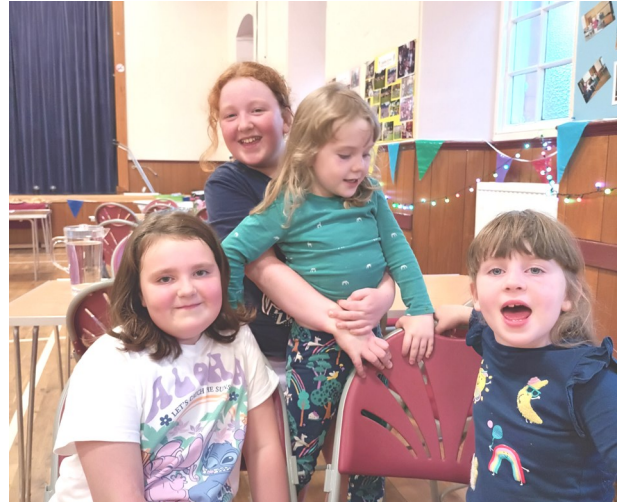
Don't know how these girls managed to keep going! They learnt some new ceilidh dances too!