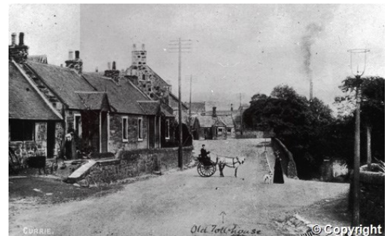
Currie Toll dating from 1890-ish

The Gibson Craig Halls are situated at the heart of Currie on the main Lanark Road West. The No. 44 bus stops outside. When not used by Currie Kirk organisations the halls can be let to community and commercial groups, and one-off social events. We have a large hall, a smaller hall, a lounge, kitchen, accessible toilets and ramps for wheelchair users.