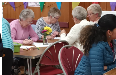
This quiz is hard!