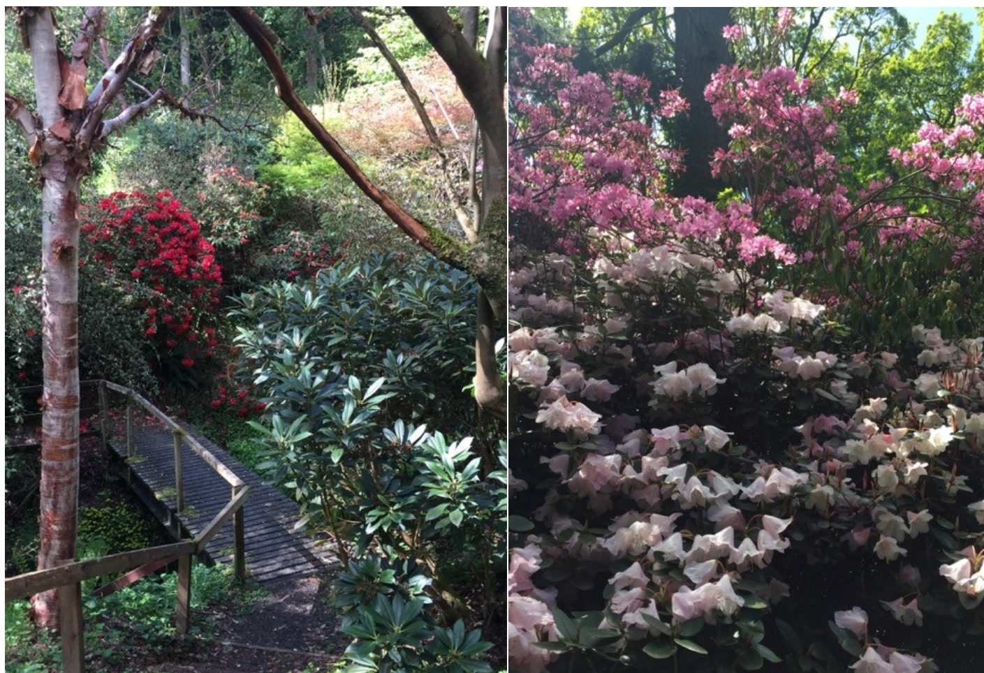
Photos taken at Glendoik Garden Centre