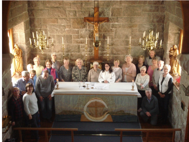
The Chapel in Bishop's House—Easter led all services

The lucky few who ventured to Staffa were treated to a display as the Puffins came out to welcome them.