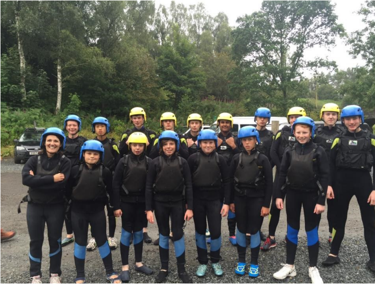
Kitted out and ready for White Water Rafting on the River Tay

During the summer the Company Section boys went on their annual camp to Craggan, Loch Tay. The weather wasn't particularly kind, however, everybody still got involved and had a great time. This year we were joined by our Chaplain who took part in the white water rafting with the boys.