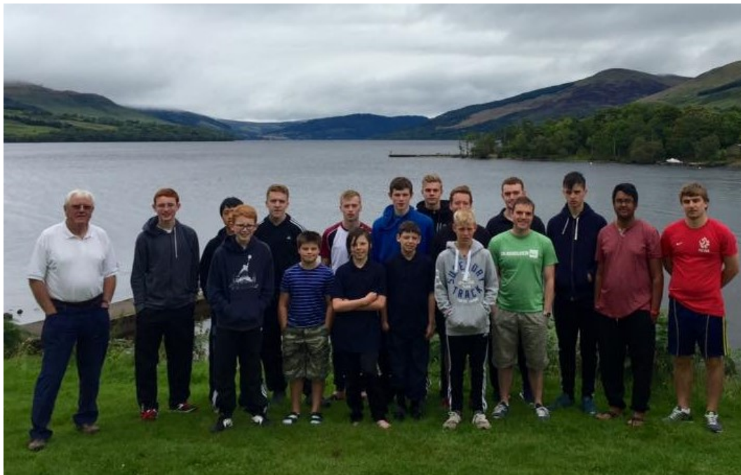
Loch Tay at Craggan—Boys and Officers at Camp