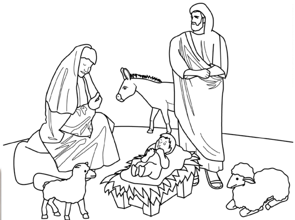
Colour in the picture of the Babe in the Manger