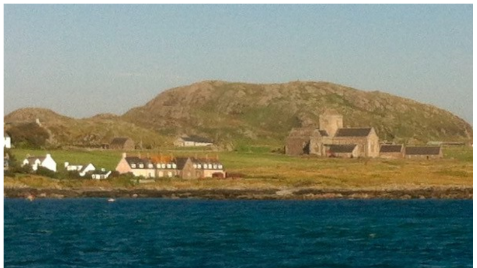
Bishops House and Iona Cathedral