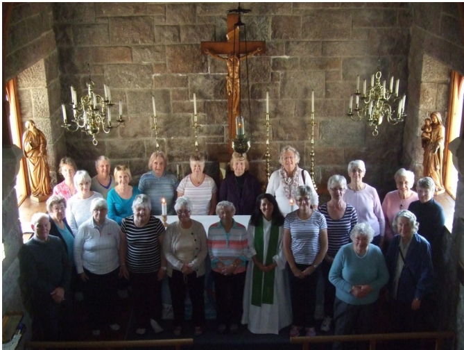
Chapel in Bishops House

On Saturday 26 September 22 ladies and one man arrived at the Gibson Craig Hall at 7.30 ready for a four-day Retreat to Iona. Stopping en route at the Green Welly at Tyndrum for a much needed coffee stop before proceeding to Oban for the ferry to Mull. It being the Glasgow holiday weekend the boat was fairly full and it did present a problem for the bus company who was going to drive the passengers to Fionnphort for the ferry to Iona. Quite a few travellers from the States and England did not understand that it was a “public service bus” and were of the opinion that their group had priority, however, the ladies and gentleman from Currie had other ideas as they boarded—bus passes at the ready!!!