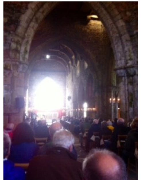
Sunday Service at the Cathedral