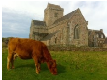
Easter's favourite photo!!