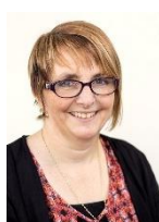
Ali Driver Education Team