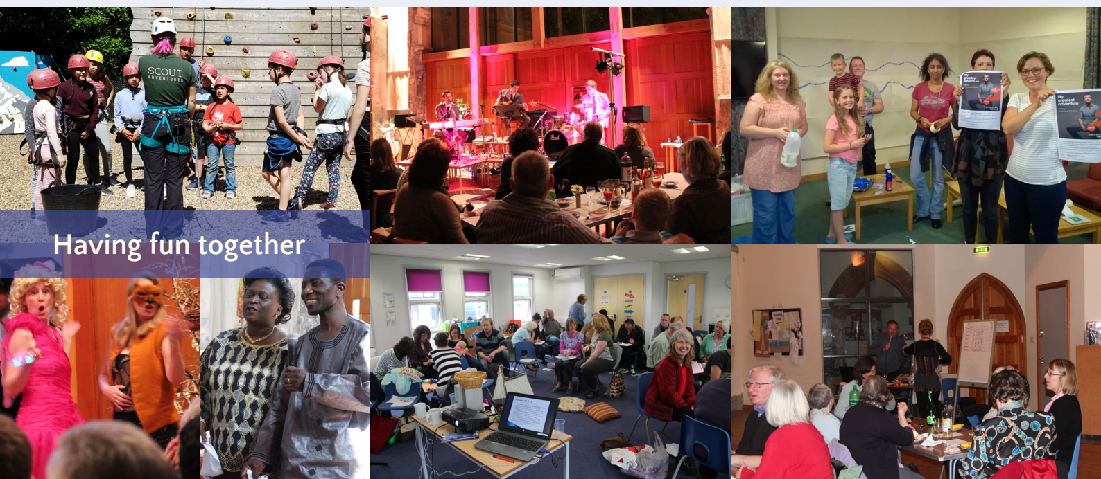
Having fun together

In recent times we have seen Holy Trinity act as a springboard to ordained ministry for a number of our members.