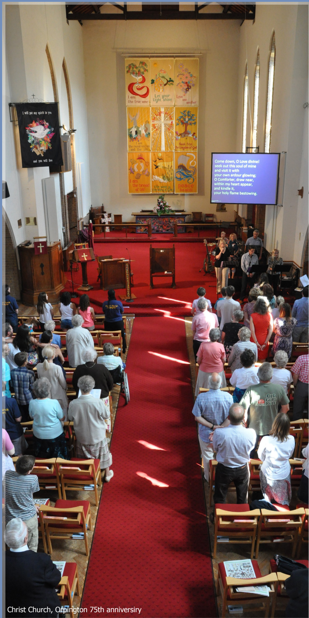
Christ Church, Orpington 75th anniversary