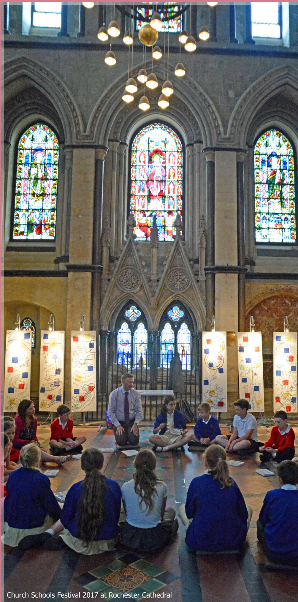
Church Schools Festival 2017 at Rochester Cathedral