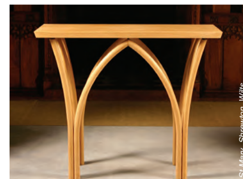
St Mary, Shrewton, Wiltshire

To join his list of satisfied customers call: 020 8850 7851 or 077 6666 2747