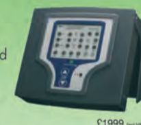
£1999 (incl VAT)

Straight out of the box the Hymnal Plus plays over 2750 traditional hymns and modern worship songs, covering over 6000 hymn book entries.