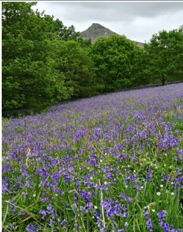
In case you don't get to see the Blue Bells