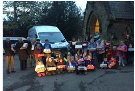
Every November I look forward to visiting Ingleby Greenhow School who give excellent support