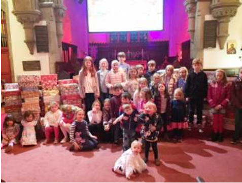
The children at the service with our wall of boxes

One of the first signs of Christmas in Christ Church are all the colourful gifts that start arriving for our annual Love in a Box Service. This is where Christmas gifts are crammed into a decorated shoebox and sent to a poor child in Romania for Christmas.