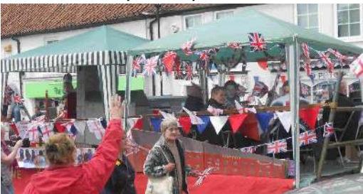
Yatton House Float