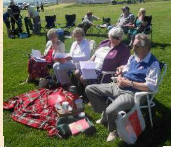
A picnic in the sun