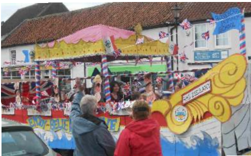
Roseberry Primary School Float