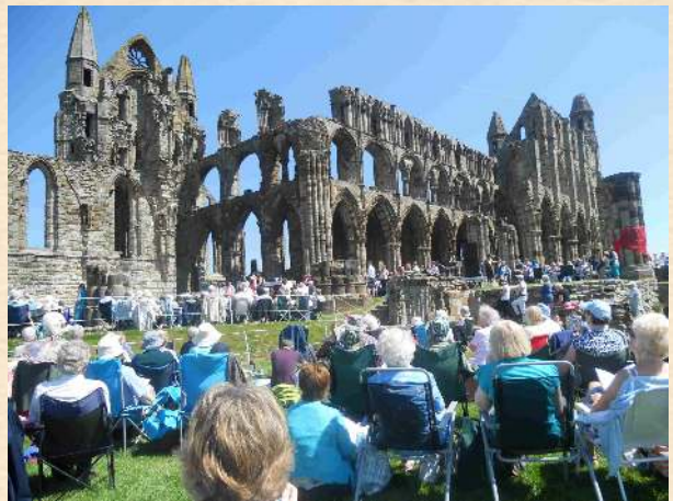
On a clear day the views were tremendous