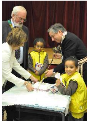
Cutting the Jubilee Cake with style!