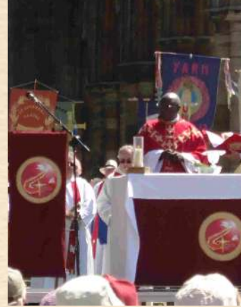
Archbishop Sentamu presiding uniquely