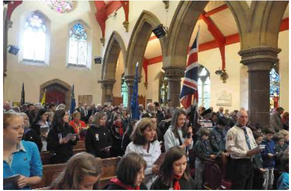
The flags were paraded into a full Church