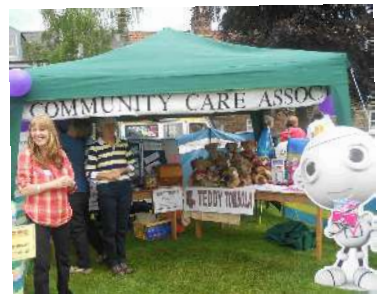
One of the many stalls on the green

Well done to all who participated in the village fete, ran stalls, built floats, played music, paraded, organised, set out and cleared away for yet another most successful Fete. Yes, we could have had better weather - but we could have had worse too. Yes, the organisers of the Floats could have done without the anxiety of the participants initially being forbidden to ride on the floats for Health and Safety reasons - which was sensibly either changed or ignored. I took one of our dogs with me this time, and discovered its not easy to take photos one handed - so apologies they are not better. I went at 6pm for fish & chips and saw members of the Parish Council still clearing away. Well done to them for all their hard work, but couldn't we rally some more (younger) support next time?