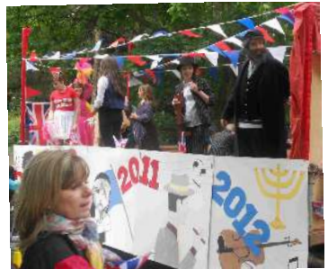
Crash, Bang, Wallop Float