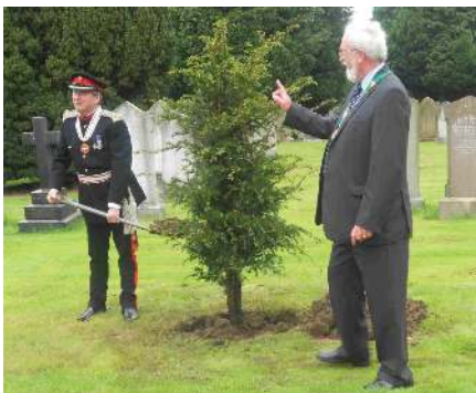
"And where shall I place this soil?"