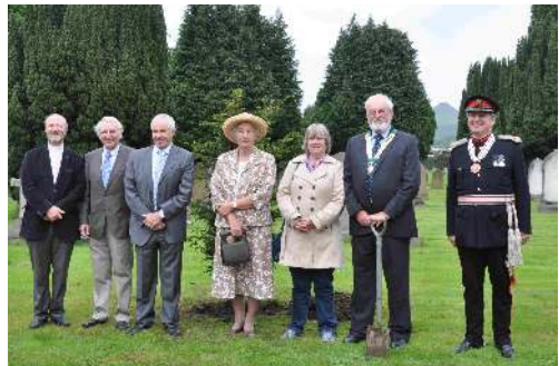
Parish Council, Deputy Lieutenant & the Vicar after planting the Diamond Jubilee Tree in the cemetery.