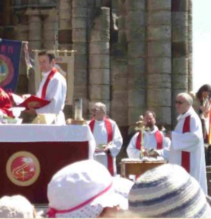
presided and preached with his unique style