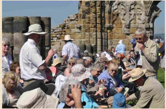
Picnicing in the Abbey afterwards