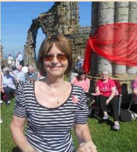
Keeping us in order!

On the sunniest Saturday we can remember, over 1,000 people gathered at Whitby Abbey to celebrate Whitsun with the Archbishop of York. This was the first time an Archbishop of York had been to the Abbey since the Reformation. It was incredible just to be there.