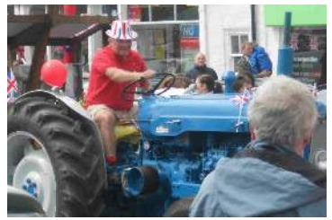
One of the vintage tractors pulling the floats. Thanks to all the drivers.