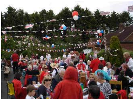
Marwood Drive residents celebrate the Jubilee with a huge street party for all residents.