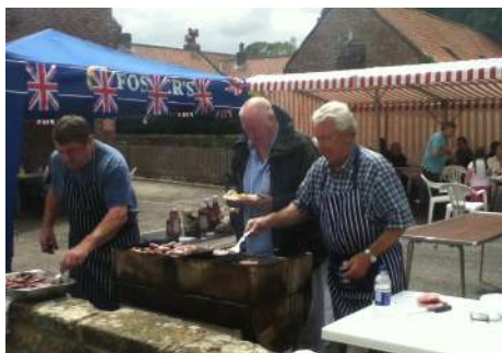
Petch's burgers and sausages grilled to perfection at the Conservative Club Barbecue.