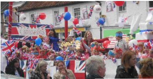
Marwood C of E Infant School Float.