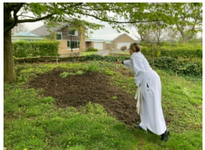
Tree planting for the Queens Diamond Jubilee, and the beautiful Autumn Crocuses.