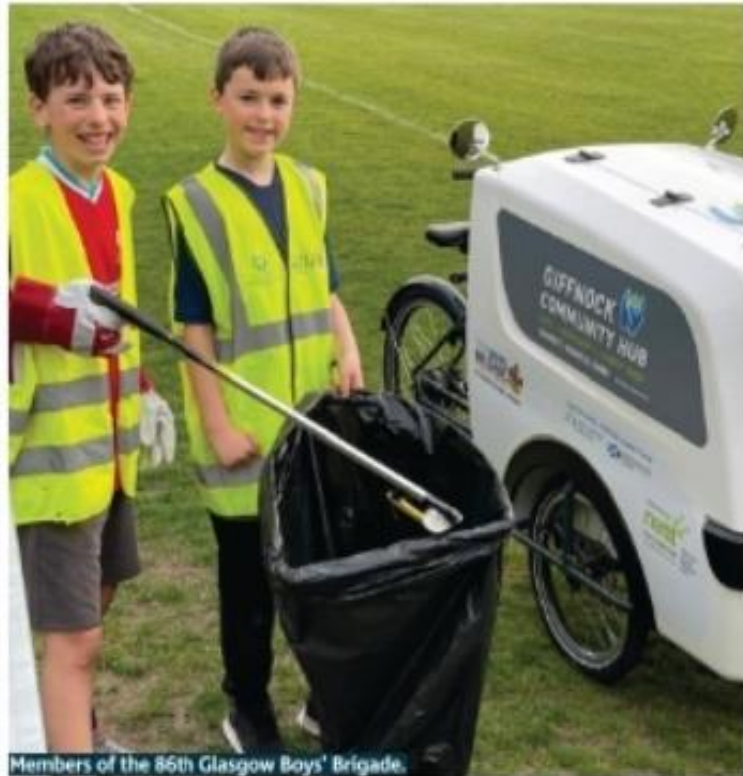
Members of the 86th Glasgow Boys' Brigade.

The BB company works closely with other charities, with key work done in providing donations directly from the community to refugees, with as many as ten families supported every day.