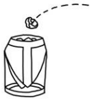
WASTE PAPER BASKET