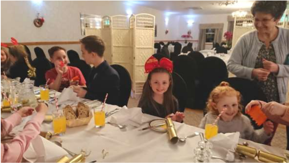
It was an evening filled with fun and smiles!