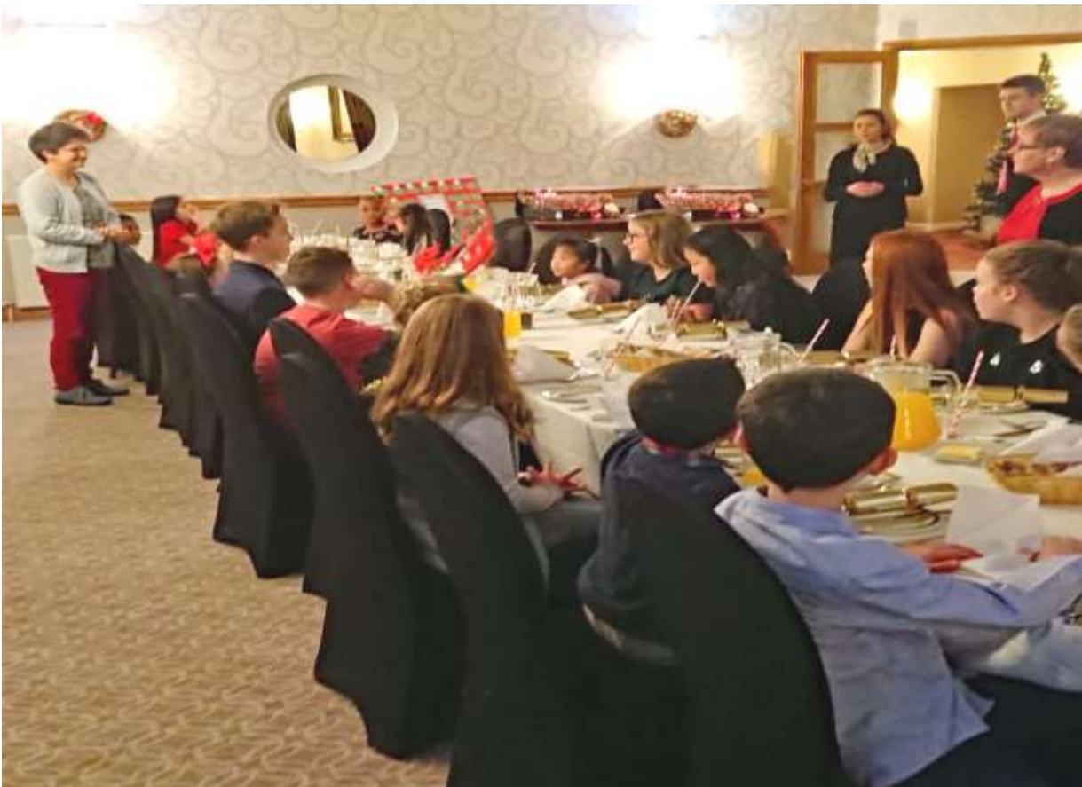
Everyone sitting ready to begin our festive dinner!