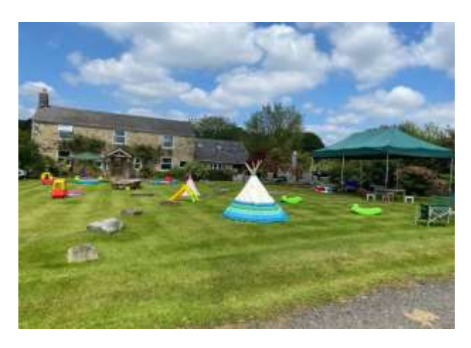
Such a beautiful day