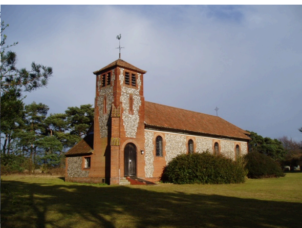
St George Six Mile Bottom