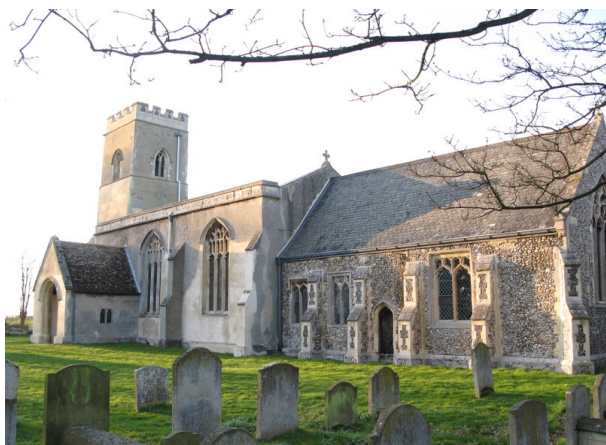
St John the Evangelist Little Wilbraham

Working together to be a Christian Community of Worship, Welcome and Care