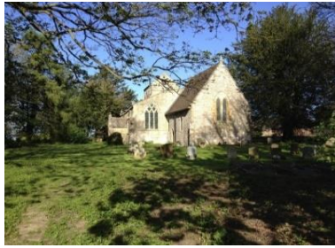
St. Lawrence, Chapel of Ease, Radstone