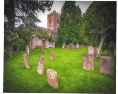
St Mary & St. Peter, Lois Weeden & Weston with Plumpton