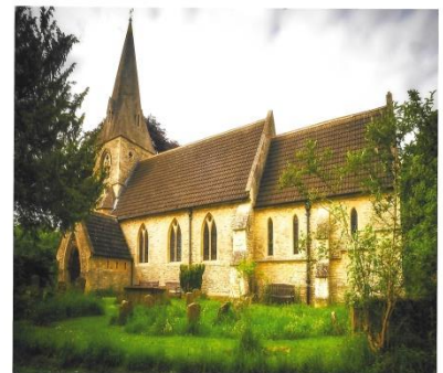
St. John the Evangelist, Whitfield