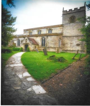
St. Mary Magdalene, Helmdon &