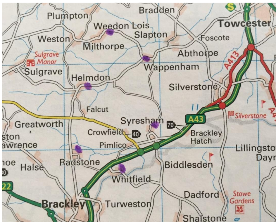
Helmdon, Radstone, Lois Weedon, Syresham, Wappenham and Whitfield

Close by are the market towns of Towcester and Brackley. Bicester, Oxford, Banbury, Northampton, Milton Keynes and Stratford-upon-Avon, are also within easy reach. We have excellent transport routes with fast trains to London and Birmingham, the M1 and M40 being 12 miles away.