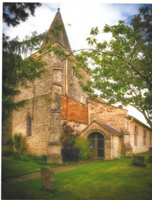
St. James the Great, Syresham