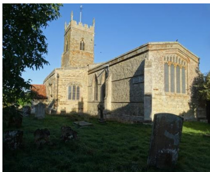
St. Mary the Virgin, Wappenham