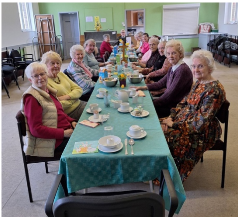
Easter Breakfast before the church service on Easter Sunday - at Trinity Dereham Methodist Church.

Please pray for the congregation and community in New Holkham