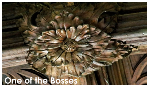
One of the Bosses