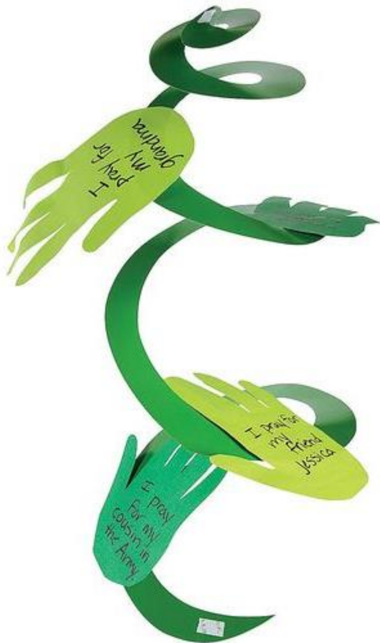
'I am the Vine, you are the Branches' mobile