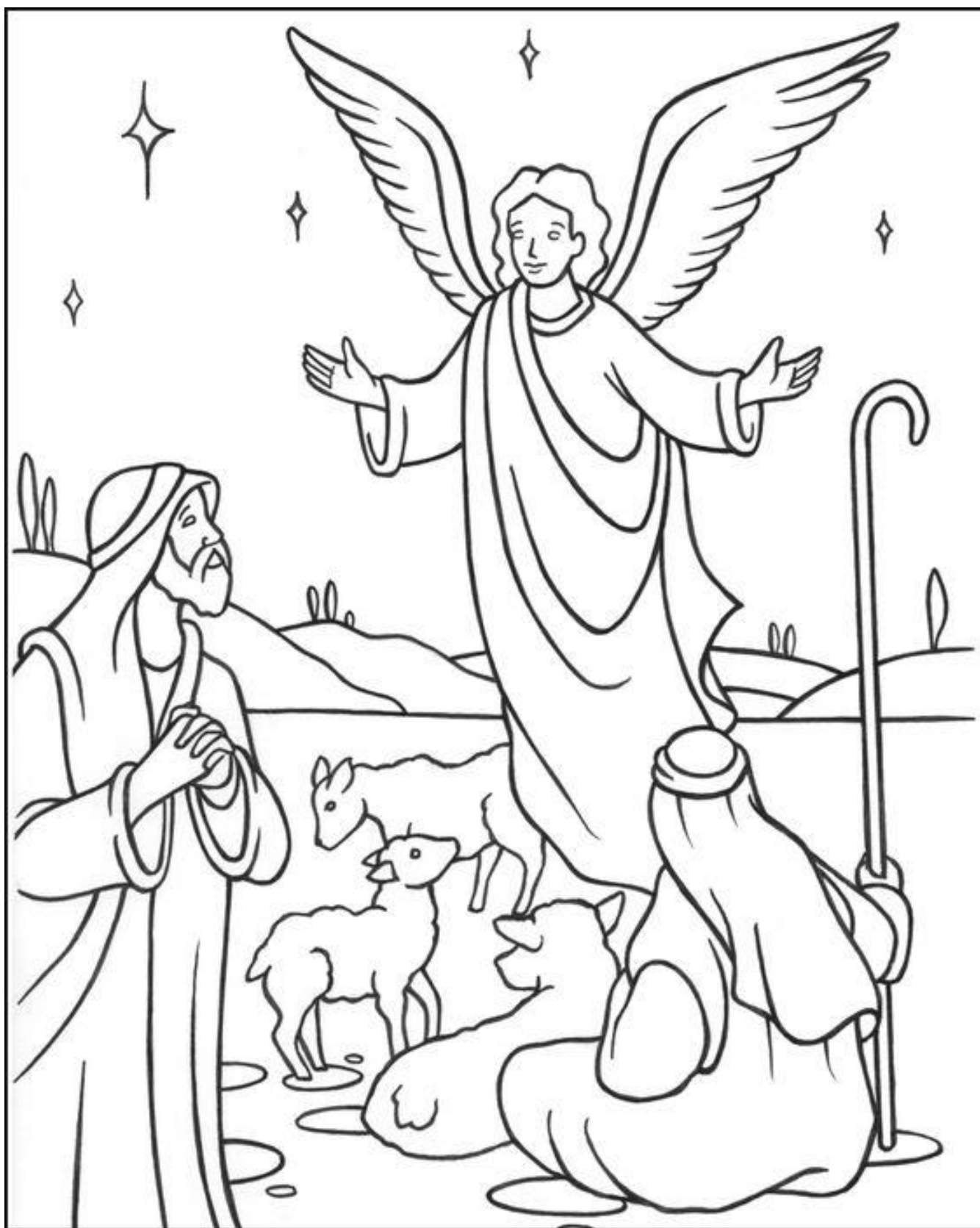
Angels and Shepherds - Gloria - © 2016 TheCatholicKid.com All rights reserved.