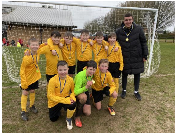
A big well done to all of you!