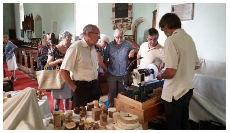
Wood Exhibition at Hasketon

St Andrew's church is located centrally in this spread-out village. It has Saxon origins and a Norman