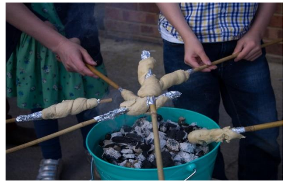
Messy Church is a key part of our activities

Some of the ministry team, including the rector, meet on Thursday mornings (using Zoom where necessary) for prayer, sharing thoughts on the lectionary readings for the following Sunday, and planning.