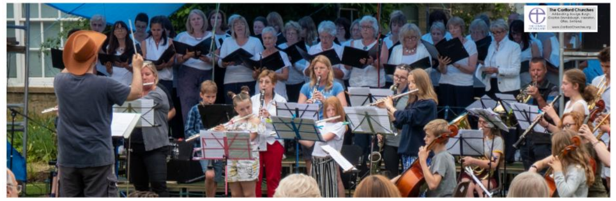
Midsummer music in Grundisburgh with over 400 people attending.

1. Who we are, what we offer, what we are looking for, opportunities and challenges