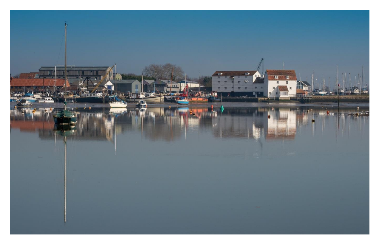
Woodbridge Tide mill and River

Woodbridge deanery synod meets together three times a year but takes forward the work of the deanery action plan in three geographic areas – west of Woodbridge (where we are), Woodbridge, and east of Woodbridge.