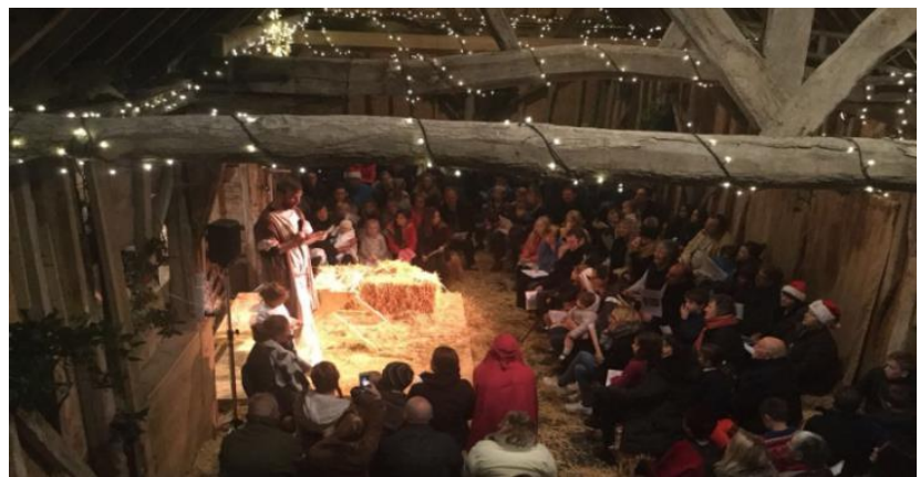
Crib service in a Barn at Otley

The church is medieval, grade II* listed, and well-maintained. The Otley Church Preservation Trust, a charity has raised considerable