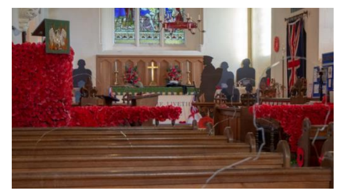
Remembrance at Clopton

At the church's west end is a memorial to American airmen from nearby Debach Airfield, who died in the last war: strong links are still maintained with their families in the USA. Opposite the memorial is our heritage centre with the records of all the fallen, and also extensive information about the locality.