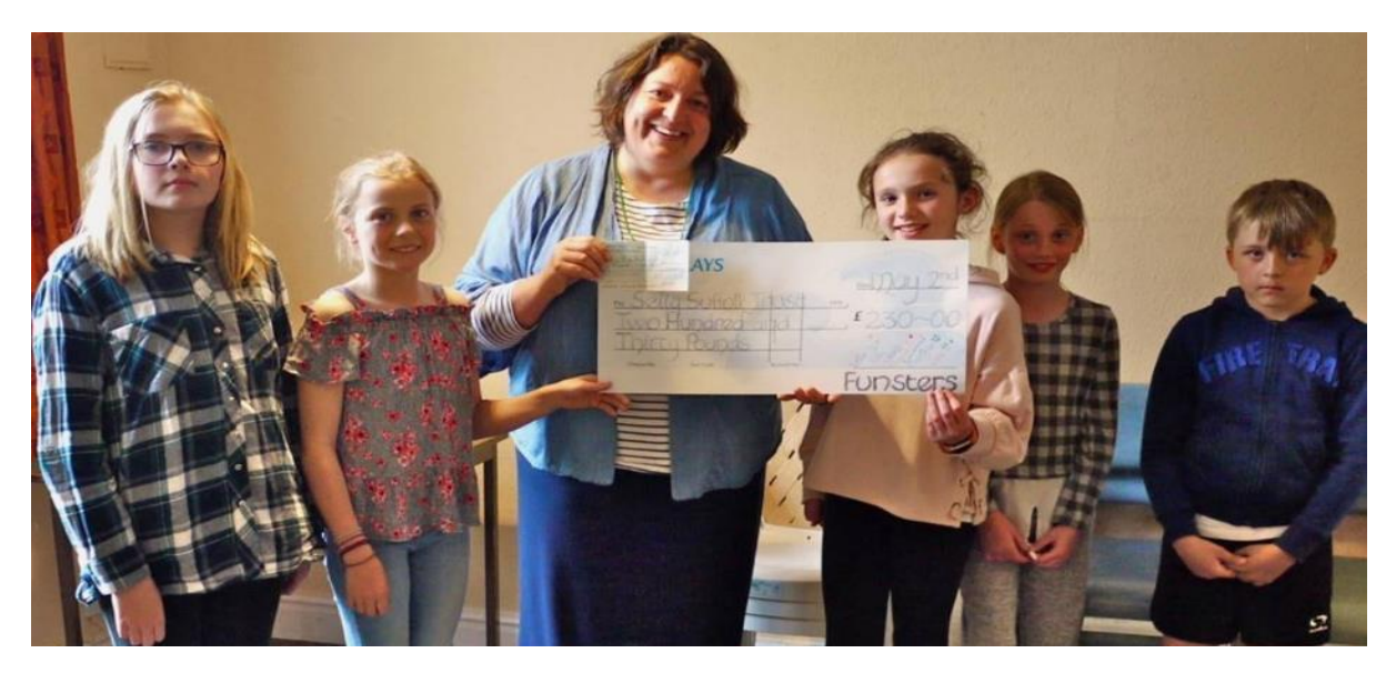
Supporting charities is important to us.

As restrictions imposed by the corona emergency are lifted, all churches will be presented with new opportunities to do things differently and reach people in new ways.