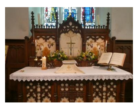
The altar at Burgh

Burgh Church School Room dates from 1835 and is located near the entrance to the churchyard. Friends of Burgh Schoolroom (FOBS) was established in 2009 to raise money for the refurbishment and extension (for a kitchen and toilet) of the Schoolroom for the church and community. The building is used for fund-raising events such as coffee mornings and soup lunches and may be hired out. FOBS was disbanded in September 2019 and management of the Schoolroom was handed back to the PCC.