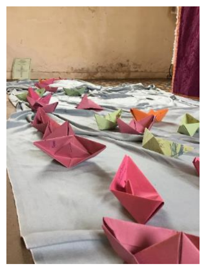
Our worship is often creative

There are currently 244 people on the church electoral rolls: Ashbocking 16; Burgh 20; Boulge 8; Clopton 8; Grundisburgh 103; Hasketon 36; Otley 21; Swilland 9; and Culpho 23.