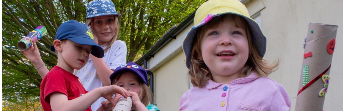
Some members of Messy Church