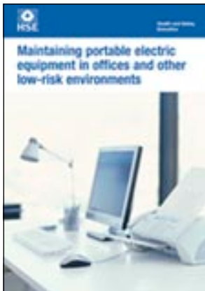
This is a web-friendly version of leaflet INDG236(rev1), revised 04/11

This leaflet sets out the precautions which can be taken to prevent danger from portable electrical equipment in those premises where risks are generally low, eg offices or libraries. The precautions are similar to those for electrical equipment used in other premises, but are matched to low-risk environments.