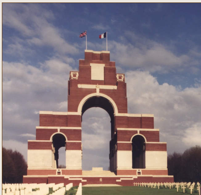
Commemorated in perpetuity by the Commonwealth War Graves Commission

This Memorial to the Missing of the Somme bears the names of more than 72,000 officers and men of the United Kingdom and South African forces who died in the Somme sector and have no known grave.