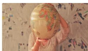
Mission and Ministry