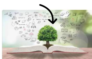
Children, Schools and Young People