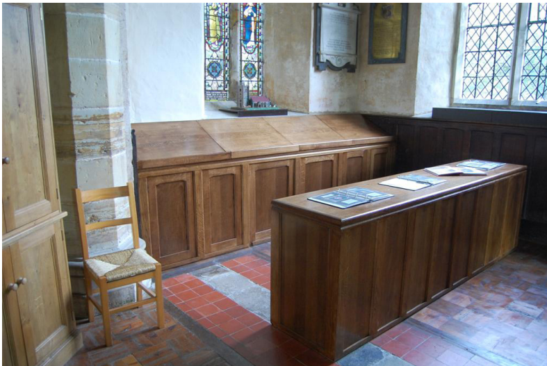
Tea station in closed position

The new tea station and servery have been designed as two separate custom made components, both constructed in stained oak. The tea station comprises an oak counter top incorporating a stainless steel sink unit mounted on top of an oak cupboard unit. These are concealed below an angled hinged lid in four sections. The unit has five cupboards to provide storage for cutlery, crockery and tea towels as well as the water heater and cleaning materials. The separate matching servery unit incorporates further oak storage cupboards for crockery below.