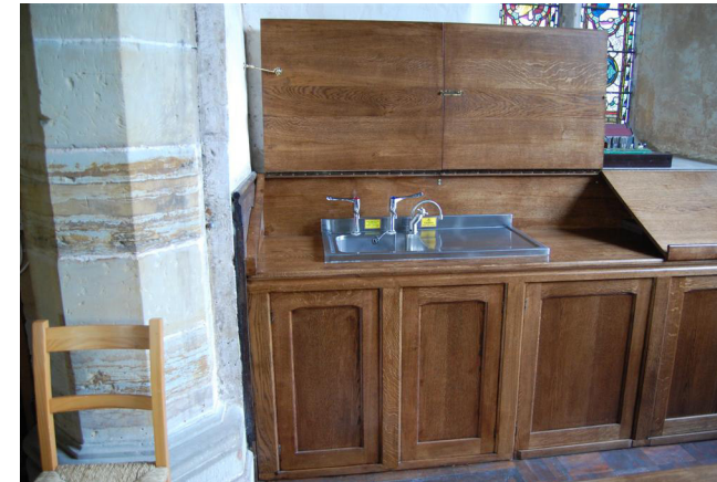
Tea station in partially open position to show sink unit