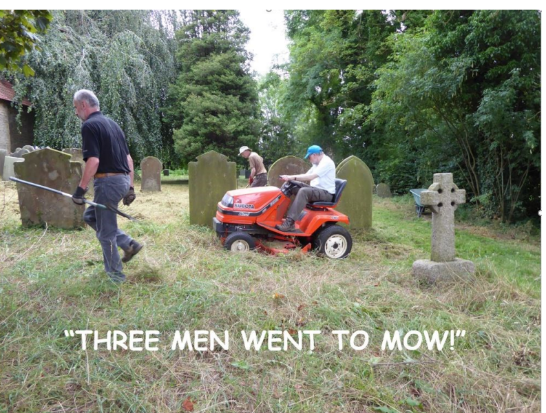
A sit-on mower was a big help, but had to be driven carefully to avoid hidden gravestones.