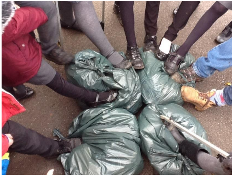
Litter picking in our community as part of our Young Leaders Award

A quote from a child: "The church really helps me to learn more about what God means in my life. It also helps me to know how to make the right choices. I love being a part of our school."