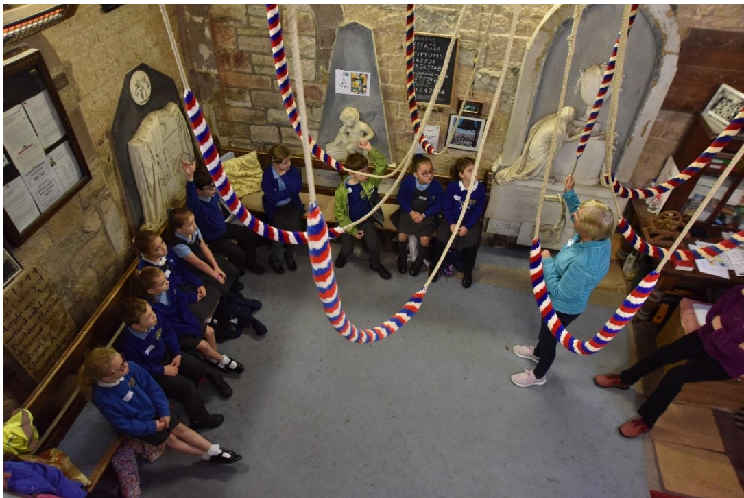
Bell ringing with one of our governors.

The strong bond between All Saints' school and church provides an excellent foundation for all links to our strong RE curriculum. Projects are created for the children, which fit in with a unit of work on Christianity. Leaders of the church have worked alongside subject leaders in school while implementing new RE ideas, such as the Understanding Christianity curriculum. Both have also played a part in the work we have done in alliance with these charities Christians in Schools Trust, Christian Aid, Compassion, Uganda Centenary School, Potters Village and Archbishop of York Young Leaders Award. Both the school building and the church building, have art work displayed that has been created by the children, whilst being supported by the church community. A prominent church noticeboard displays photos, artwork and writings sharing the school's current activities.