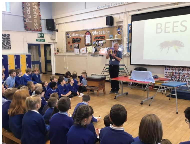
A member of church contributing to our learning on how animals are very important global neighbours.