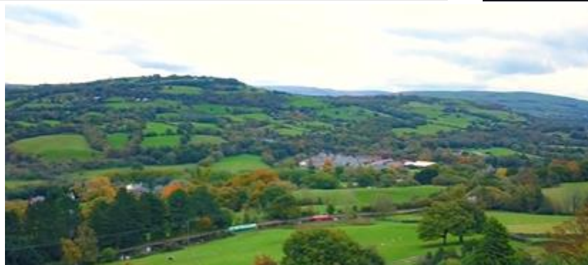
The beautiful village of Marple

"How beautiful on the mountains are the feet of the messenger who brings good news, the good news of peace and salvation, the news that the God of Israel reigns!" Isaiah 52:7 NLT