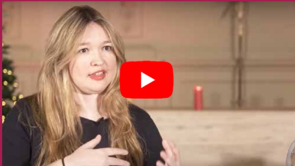
On the 25 November, the Church of England premiered a film to launch the theme and the national resources available.

A wide range of resources and support is available for use by churches, including webinars, printed materials, and reflections.