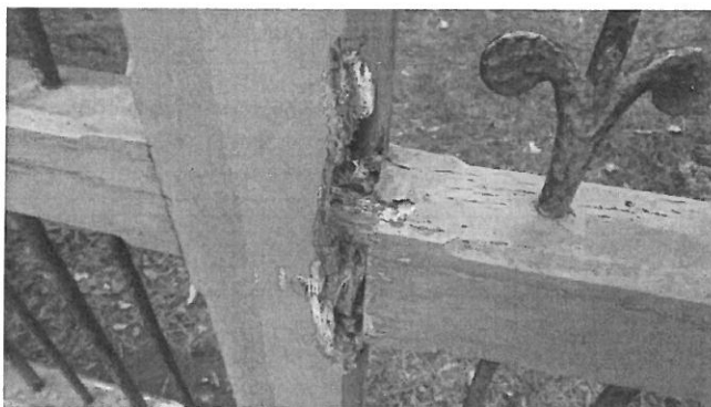
Decay centre rail; bar terminals.