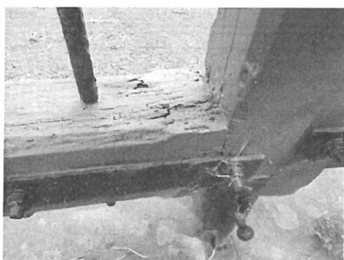
Bottom rail, decay.