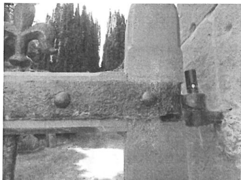
Detail of the hinges & gudgeons.