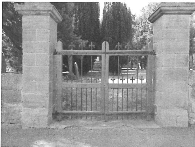
General view of the gates from the north.