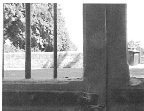
Meeting frame from south.