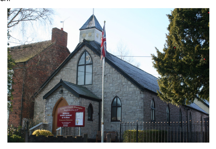
ST. MARK'S IN SHAVINGTON

All Saints' churchyard is not a burial ground but there is a council cemetery about ¼ mile from the church.