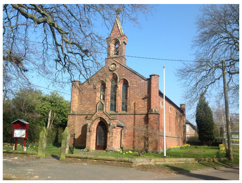
ALL SAINTS' IN WESTON

Our Parish was formed in 1974 by the joining of two churches from other separate Parishes, St. Mark's in Shavington (previously in Wybunbury Parish) and All Saints' in Weston parish.