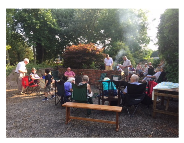
PCC BBQ 2018

Additionally each church has a management group which organises fund raising, housekeeping and repairs.