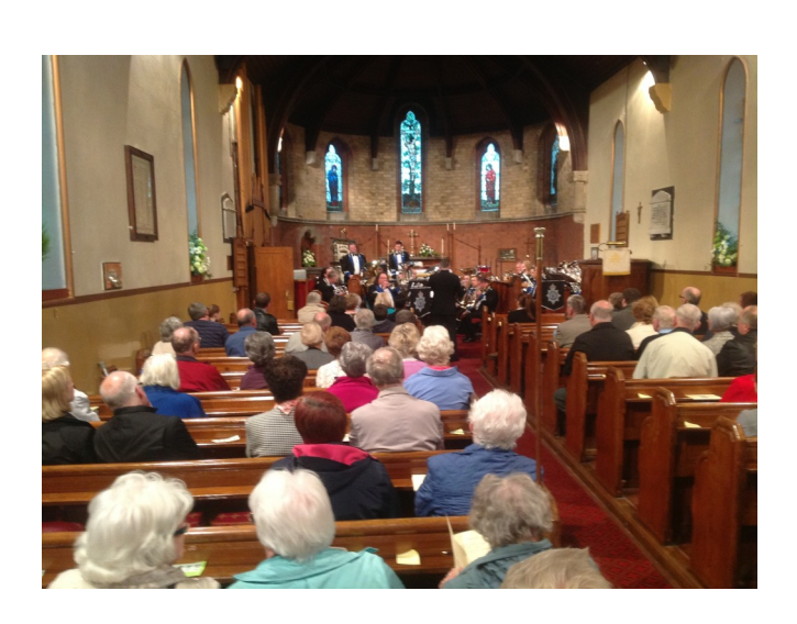
BRASS BAND CONCERT IN ALL SAINTS'