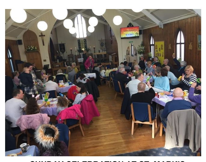
SUNDAY CELEBRATION AT ST. MARK'S