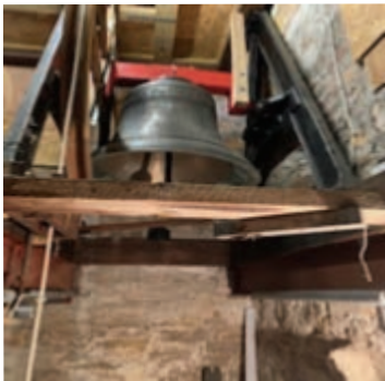
Photo 2 - The 5th bell raised in 'up' position for ringing

Photo 1 - The 5th bell in the "down" position