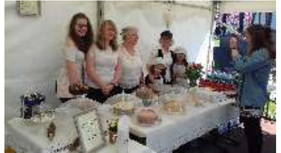
The Victorian Tea Ladies looking their best

Many made use of the Victoria Tea Tent with its delicious home made cakes, which did a roaring trade all afternoon as did the ice cream van. The sweet trolley was very popular with the children.