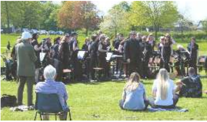
The Wirral Wind Band

The Wirral Symphonic Wind Band proved to be very popular playing a wide and delightful selection of music. They were enjoyed by many visitors with some sitting on the grass to follow and listen to the joyful sounds that the Band produced adding to the fun of the occasion.