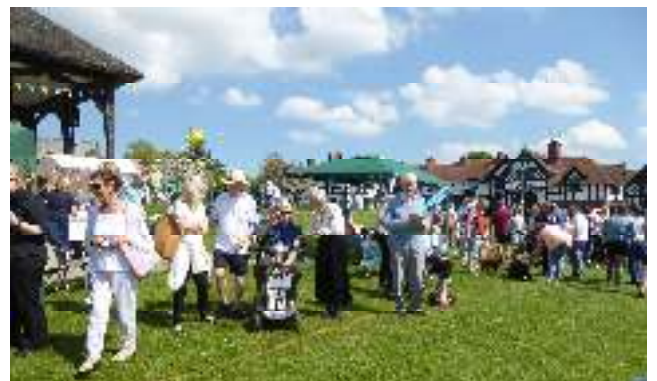
A small section of those who attended the Fete.