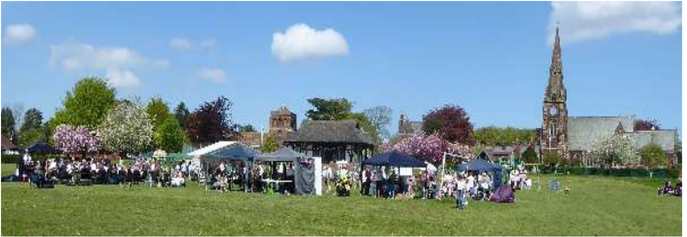
A panoramic view of the Fete

The Anniversary of the consecration of All Saints was celebrated on the weekend of 5th and 6th May with a Fete, a Flower Festival and a special service in Church. The sun shone and brought many visitors, young and old and included members of the congregation. The happy, friendly atmosphere of the afternoon enjoyed by all, helped make the event such a success.