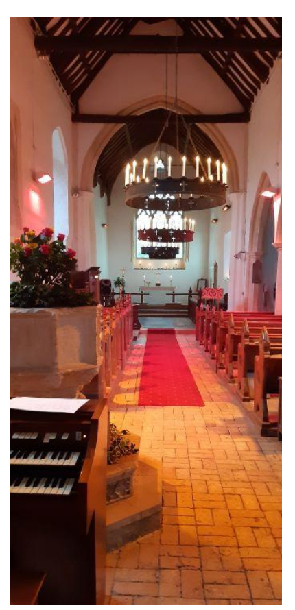
round tower in Suffolk.