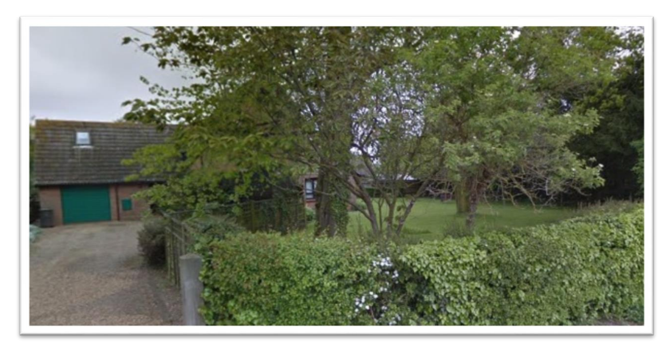
The Rectory and Rectory Garden

The Rectory is situated a few minutes' walk from the Church in Rectory Road and consists of a modern detached, brick built, 4-bedroom house. The garden is lawned and borders Rectory Road with mature trees. A drive with parking for up to 3 or 4 cars leads to the front door sited at the left of the property.