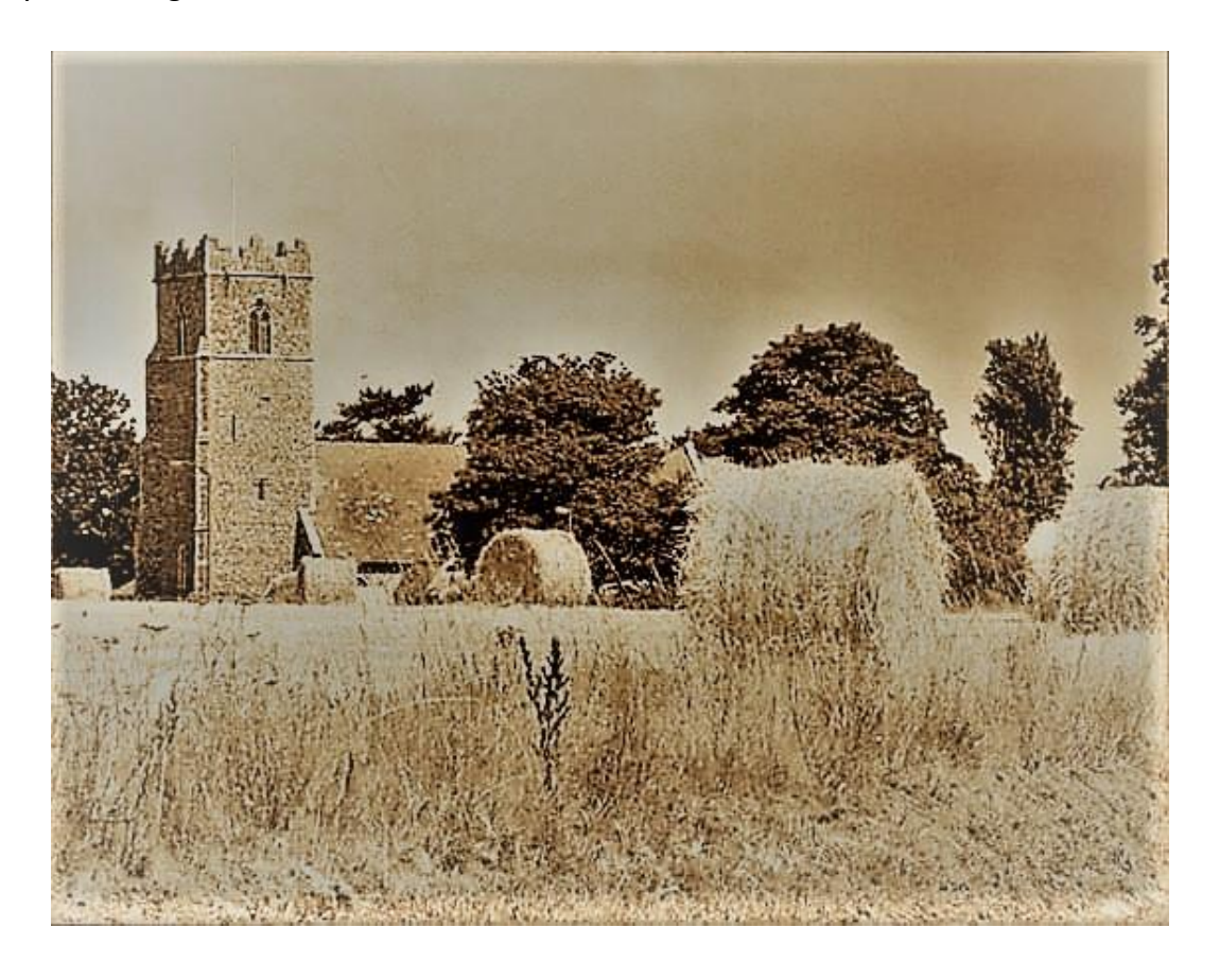
"THE HARVEST IS PLENTIFUL BUT THE WORKER'S ARE FEW. ASK THE LORD OF THE HARVEST, THEREFORE, TO SEND OUT WORKERS INTO HIS HARVEST FIELD." MATTHEW 9: 37-38.

Thank you from the congregations of St Peter's Carlton Colville and St Andrew's Mutford, in the Deanery of Lothingland, in the Diocese of Norwich.